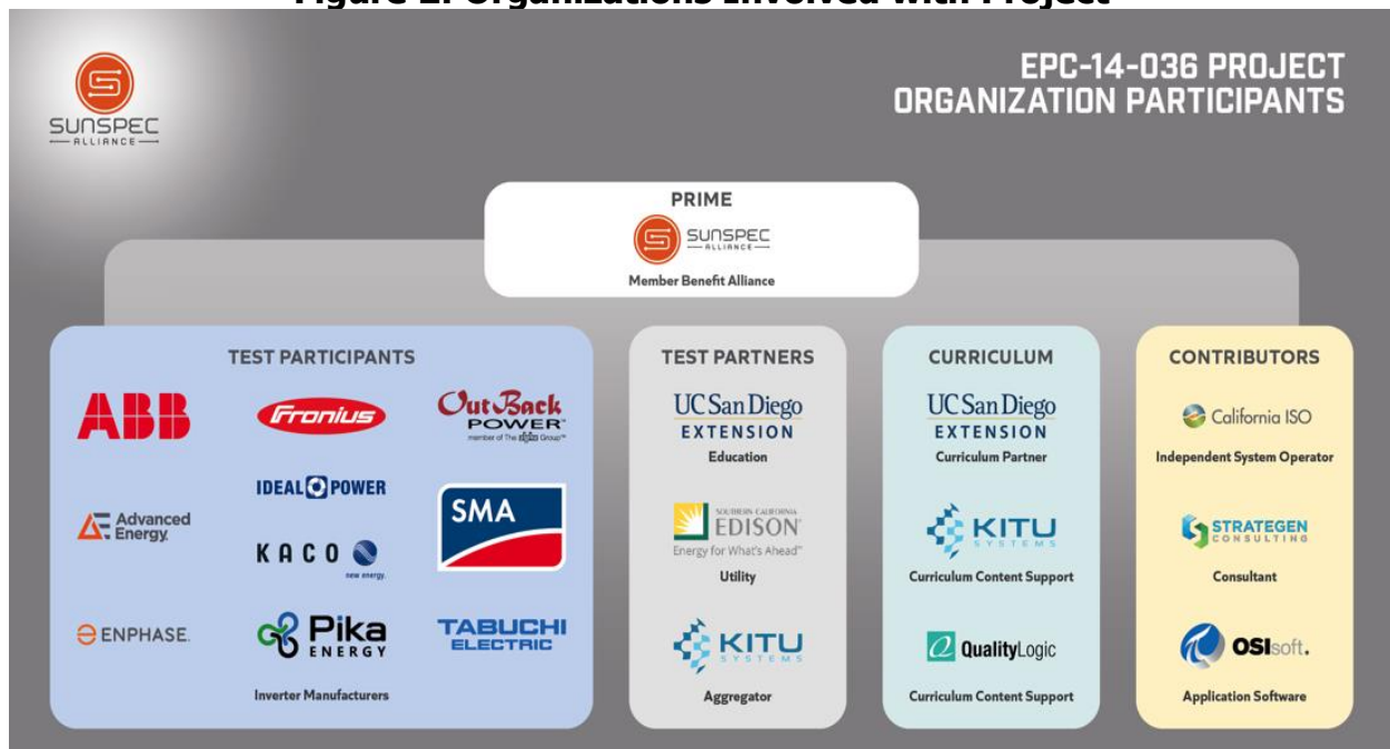
Figure 2: Organizations Involved with Project

The project engaged a diverse team of stakeholders including smart-inverter manufacturers, utilities, laboratories, DER system integrators, software developers and UC San Diego as an academic partner as shown below (Figure 2). The project team also included a technical advisory committee and the project participants.