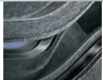
Close-up of under-the-hood part showing molten edge ready to be sealed.