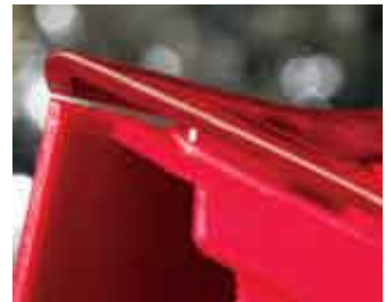
Preheating allows delay of vibration until the viscous stage, avoiding the particulates that result from friction of dry solid-solid vibration.

Once optimal weld depth is reached, vibration stops and joined parts cool into a single, clean-vibration joint, with no “angel hair” by-product and with excellent mechanical properties.