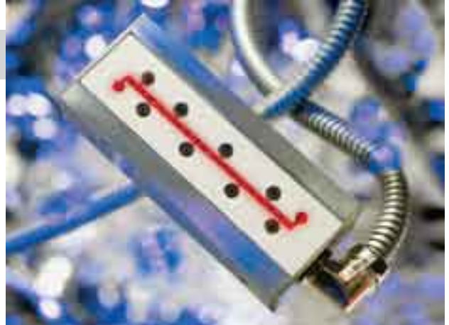
A metal-foil filament imbedded in ceramic preheats the weld lines before vibration begins, allowing the two parts to be joined without the effects from dry solid-solid vibration.

Important trends in the plastics industry have raised the standards for plastic weld joints. The increasing use of low-viscous polymers, high-temperature formulations, functional fillers, and the need for superior bonding of unlike materials have added complexity to the plastic assembly process. Designers are demanding parts with particulate-free, visible weld lines, giving them design flexibility, part integrity, and manufacturing efficiency in their products.