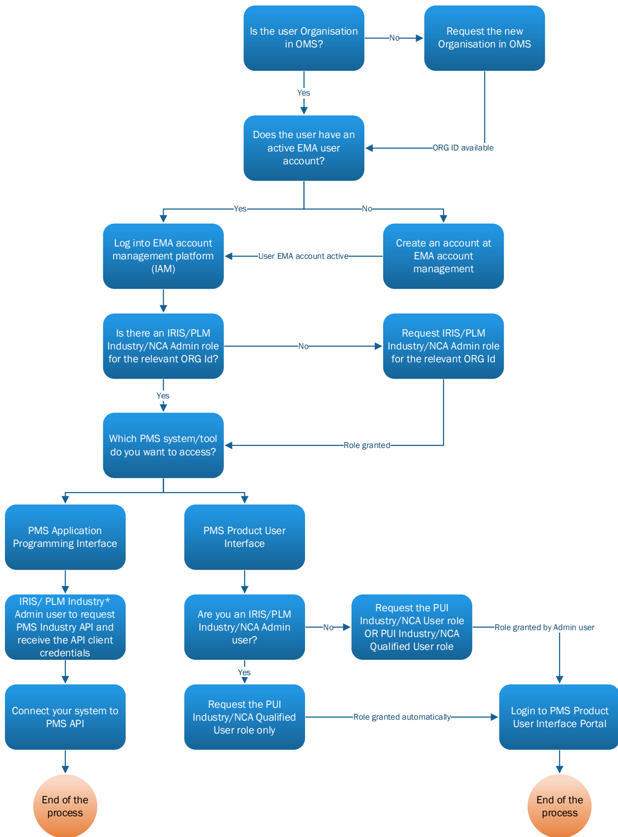
Figure 1: Overview on the PMS registration process