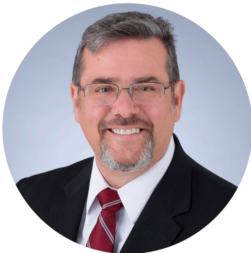
COMMISSIONER Donald L. Palmer