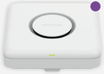
WBE750 BE18400 Tri-Band PoE 10G WiFi 7 Access Point