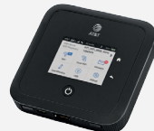
MR5100 Nighthawk 5G WiFi 6 Mobile Hotspot Pro for AT&T