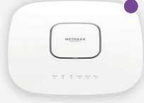
WAX630 Tri-Band AX6000 Access Point