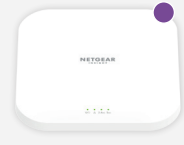
WAX620 Dual-Band AX3600 Access Point