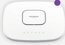
WAX630E Tri-Band WiFi 6E AXE7800 Access Point