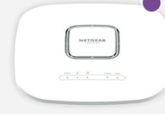
WAX625 Dual-Band AX5400 Access Point