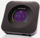
MR1100 Nighthawk M1 4G LTE Mobile Router