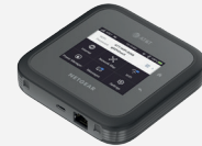
MR6500 Nighthawk M6 Pro 5G WiFi 6E Mobile Router for AT&T