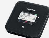
MR5200 Nighthawk M5 5G WiFi 6 Mobile Router