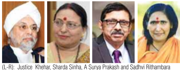
(L-R): Justice Khehar, Sharda Sinha, A Surya Prakash and Sadhvi Ritambhara