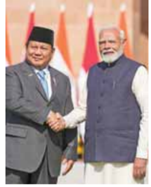
Prime Minister Narendra Modi and Indonesian President Prabowo Subianto prior to their meeting at the Hyderabad House, in New Delhi