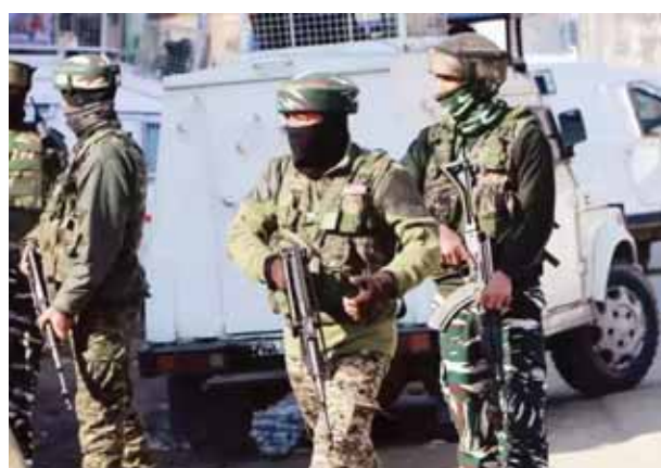
during an encounter with terrorists in south Kashmir's