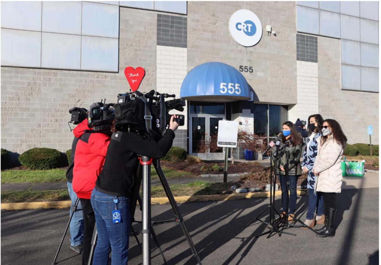
Hop on socks. On the day CRT received 1,200 pairs of new socks from the fall "Socktober" drive, all four local TV stations came out to help spread the good news!