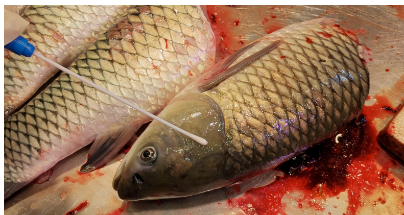
Figure 1 - An image of freshwater fish swab taken during field investigation performed by CHP at local wet market.

Group B Streptococcus (GBS), Streptococcus agalactiae , is an encapsulated gram-positive non-motile coccus bacterium. It is widely distributed among diverse species including humans, mammalian animals, amphibians, reptiles and fishes. GBS is found in 20% to 40% of healthy adults and colonises in human gastrointestinal and genitourinary tract as commensals 1 . Since the 1960s, GBS has been increasingly recognised as a common pathogen of severe invasive diseases among vulnerable populations. It is the leading cause of neonatal meningitis and sepsis, which is acquired vertically through contact with mucous membranes or infected amniotic fluids 2,3 . It is also a significant cause of severe infections among vulnerable adults including sepsis, septic arthritis, meningitis and infective endocarditis, but the source of these infections largely remained unknown.