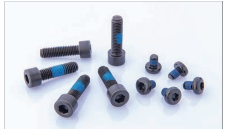
Ray Fu, an IATF 16949-certified manufacturer, is highly regarded by buyers for the exceptional production quality of its automotive screws.

Looking ahead, Ray Fu will continue to deliver high-quality products and services, expanding its product range to meet the evolving needs of its customers.