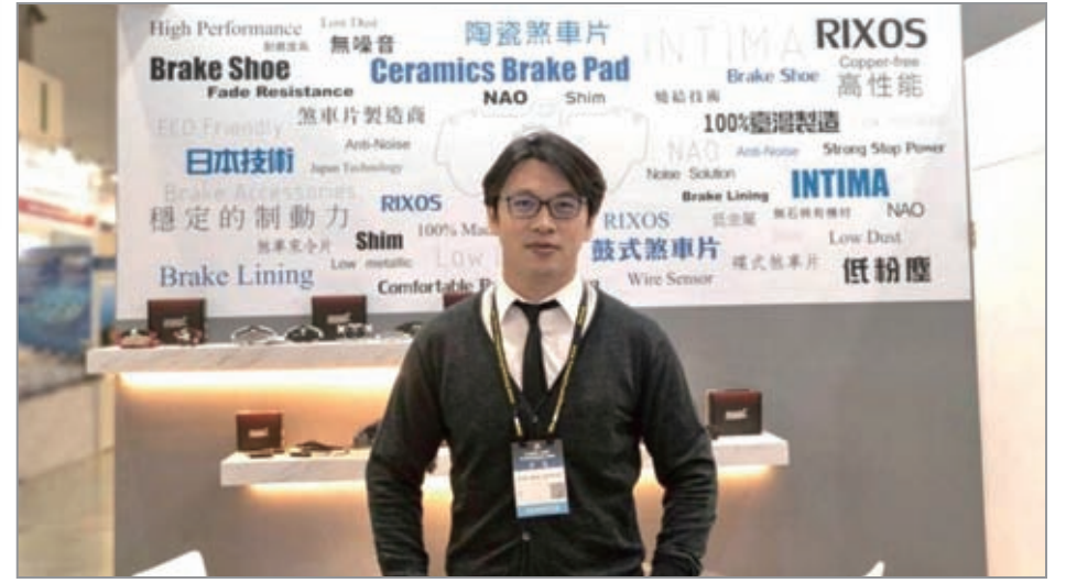
TBT has consistently maintained its industry leadership by placing a strong emphasis on research and development, particularly in the field of brake pads.

TBT's major export markets encompass Japan, Europe, North America, and more, spanning business operations across over 60 countries and serving a clientele of over 200 direct customers.