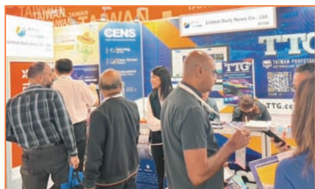
At AAPEX 2023, the dedicated team from Economic Daily News/CENS was actively distributing their professional trade magazines.

As one of the world's top three automotive aftermarket exhibitions, where over $1.8 trillion of the global automotive aftermarket industry converges, AAPEX 2024, taking place from Tuesday, November 5th to Thursday, November 7th, is the must-attend event for professionals in the sector. This year's edition spotlights the latest innovations and trends, ensuring attendees and their businesses thrive in this evolving industry landscape.