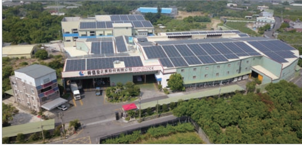
SCF's factory is now equipped with fully installed solar panels, capable of generating 1,500,000 kWh of electricity annually, equivalent to reducing carbon emissions by 750 metric tons of CO 2 e each year.

Moreover, from 2019 to 2023, SCF saved 226,379 kWh, reducing emissions by 113,606 Ton-CO 2 e. Initially generating about 2,300-2,800 Ton-CO 2 e per year, SCF set a goal to reduce power consumption by 1% annually. This was achieved by transitioning forklifts from diesel to electric, utilizing solar power, and implementing