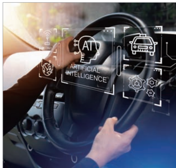
Modern vehicles now prioritize fuel and power optimization while incorporating active safety features and AI technology to enhance driving safety.