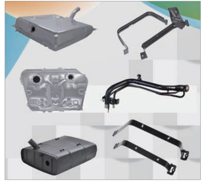
Fuel-sending units manufactured by UN Fuel Tank.

UN Fuel Tank offers a one-stop shopping service and participates in 3-4 international auto parts exhibitions annually, facilitating