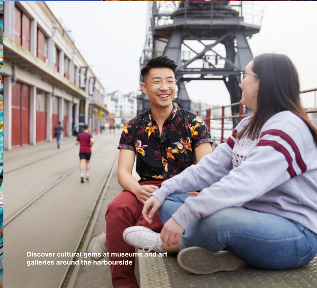
Discover cultural gems at museums and art galleries around the harbourside