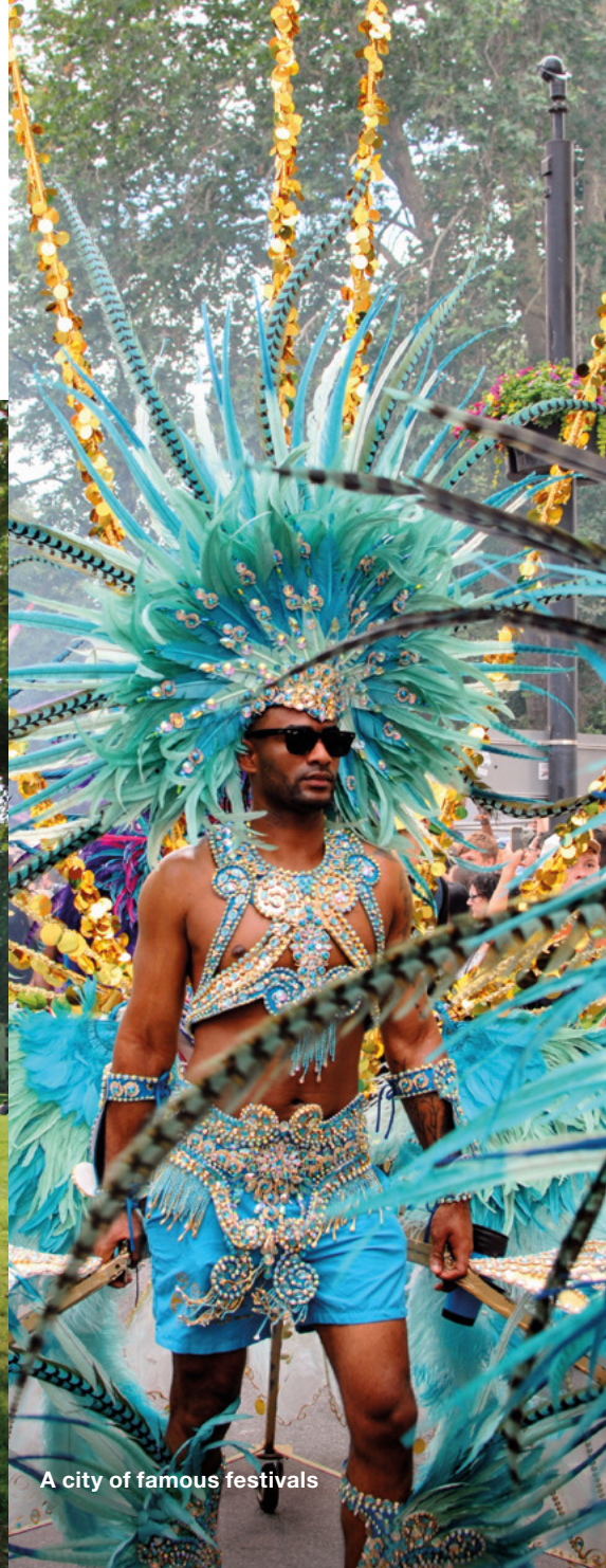
A city of famous festivals