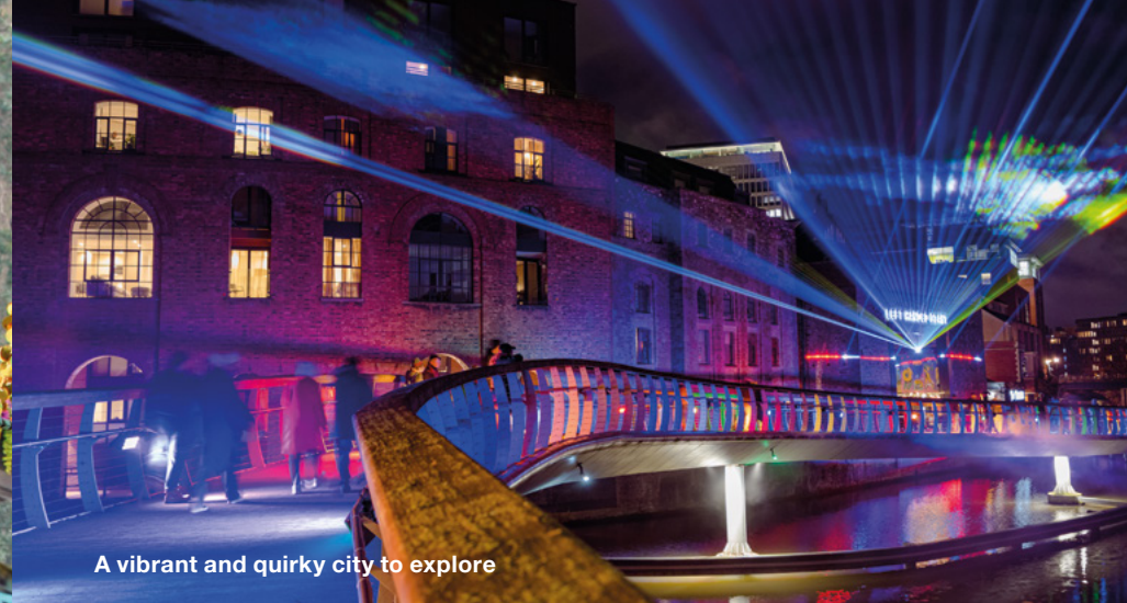
A vibrant and quirky city to explore