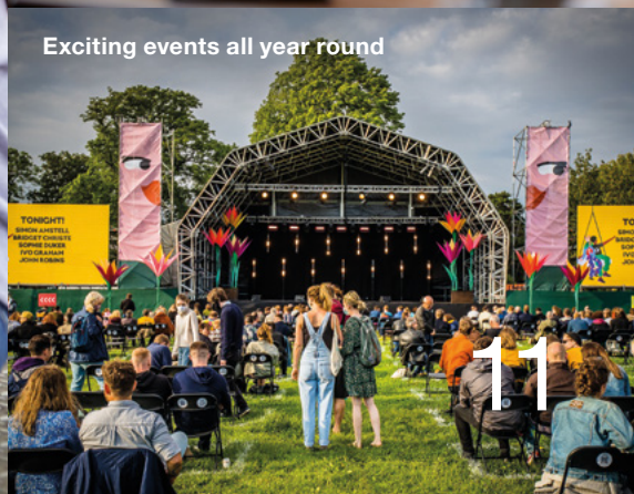
Exciting events all year round