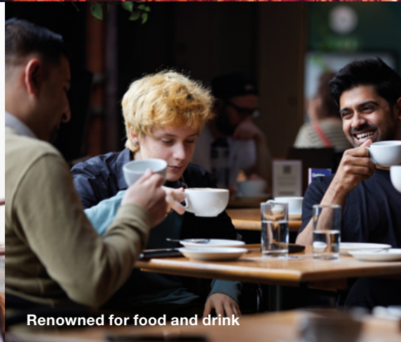
Renowned for food and drink