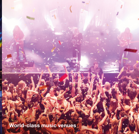
World-class music venues