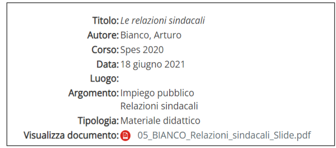
Figure 1: Institutional Documents Archive: example of a record