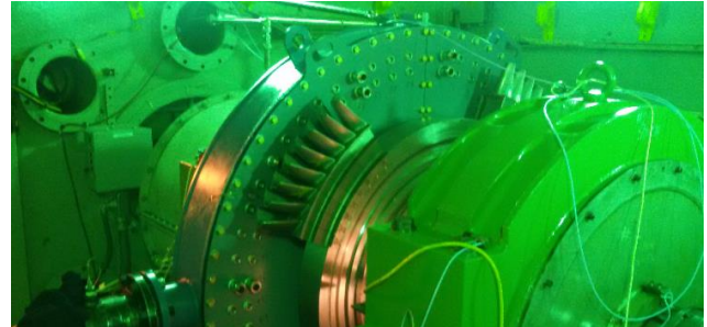
Figure 3 – Wheel Box Test – Test Cell

A final review with Chief Engineers, including data from previous tests done on baseline bucket, confirmed the alignment between analytical models and test results, closing the verification phase.