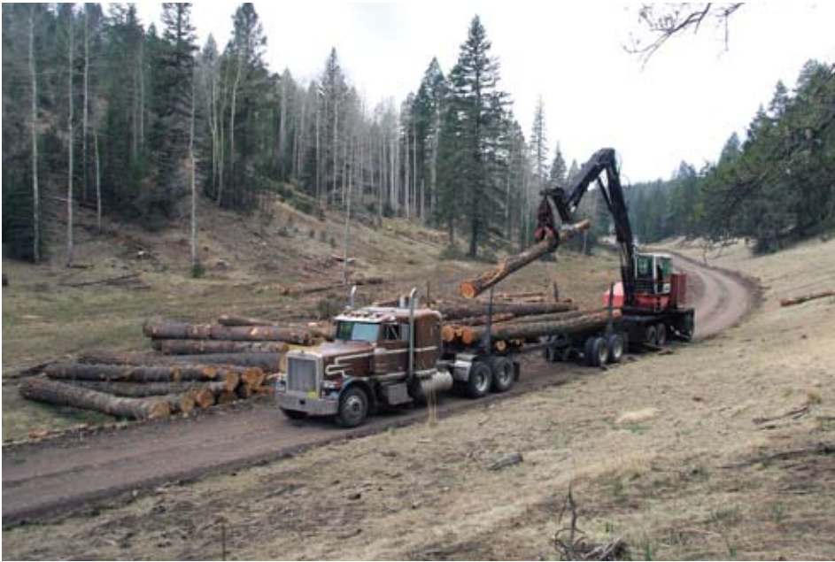
Forest Health Restoration Project on the Mescalero Apache Reservation.