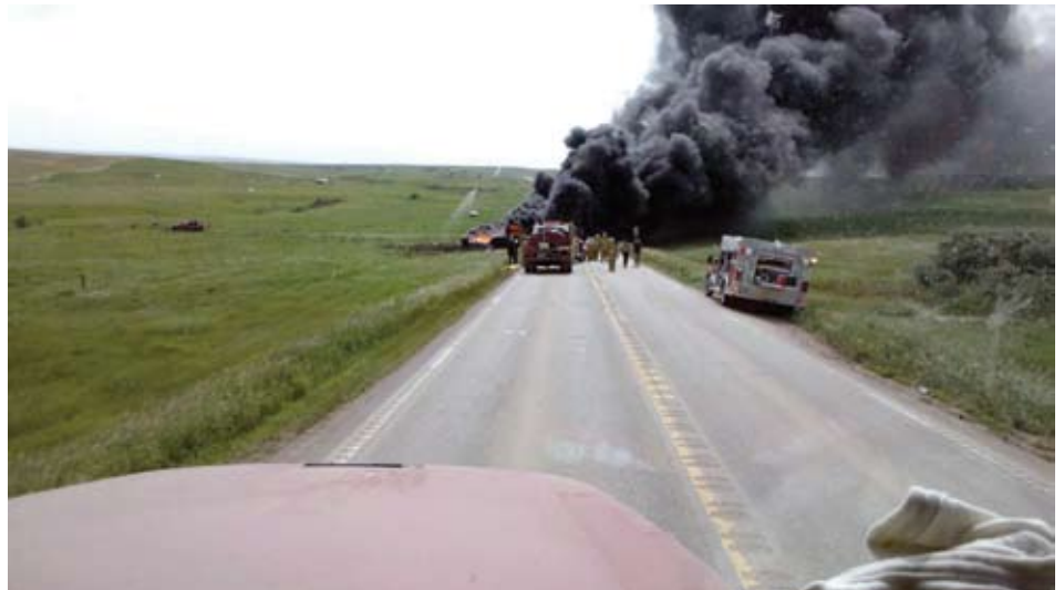
Semi carrying fuel wrecked and burned.

Impact to the reservation due to the oil industry has been increasing in the past few years. Those impacts include an increase in large