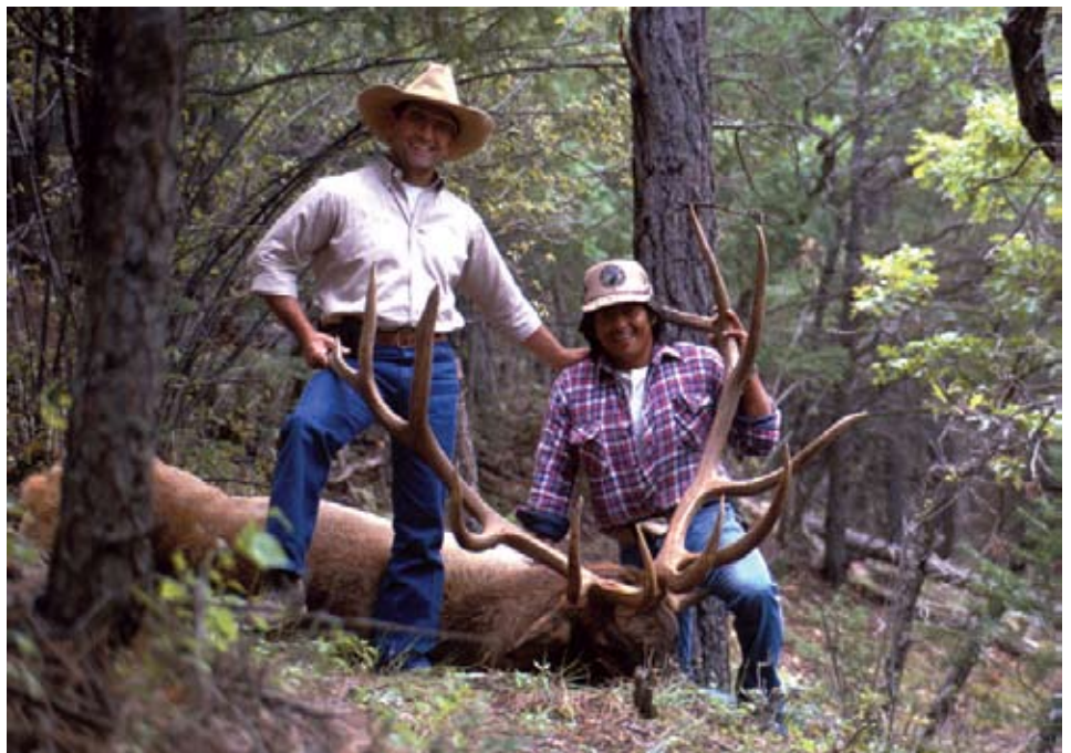
Healthy forests grow timber and antlers

To be successful, Anchor Forests must be carefully selected and implemented in a manner that can bring diverse concerns together to garner committed support. As a starting point, we suggest that the USDA Forest Service convene a meeting of representative groups such as ITC, Western