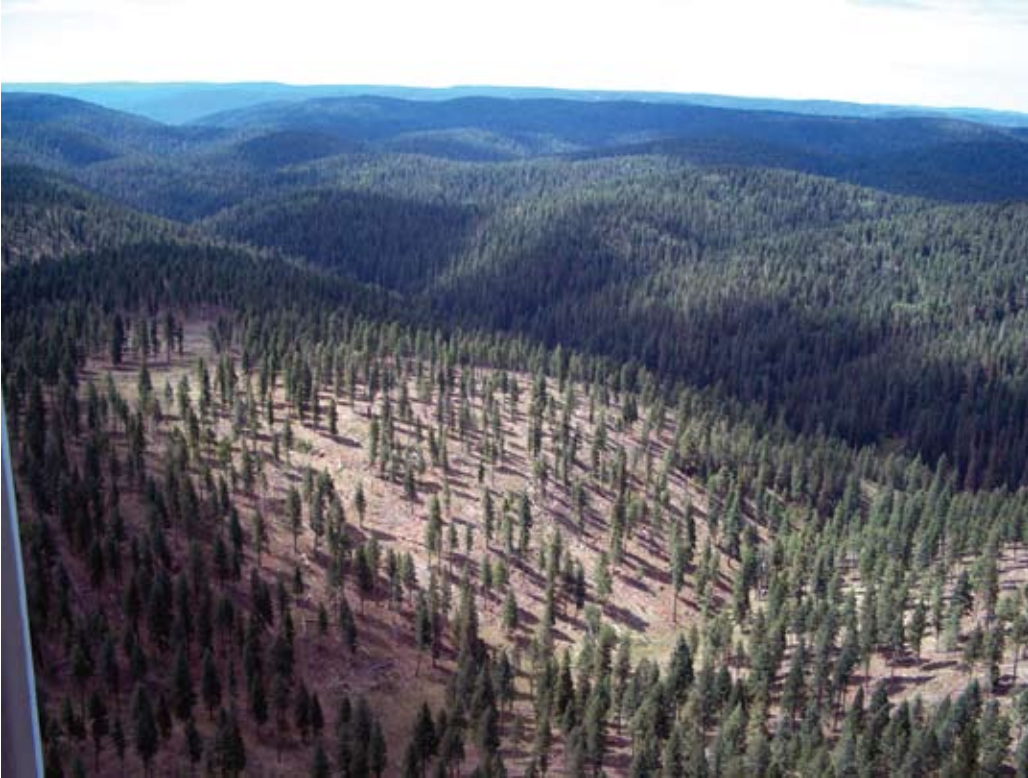
Tribal land vs. unmanaged national forest land

total manufacturing gross domestic product (GDP) in 2006, placing the forest products industry on par with the automotive and plastics industries. The industry generates more than $200 billion a year in sales and employs approximately 900,000 people earning $50 billion in annual payroll. The industry is among the top 10 manufacturing employers in 42 states. This strong economic contribution could be grown substantially with improved markets.” NASF Resolution 2011-1.