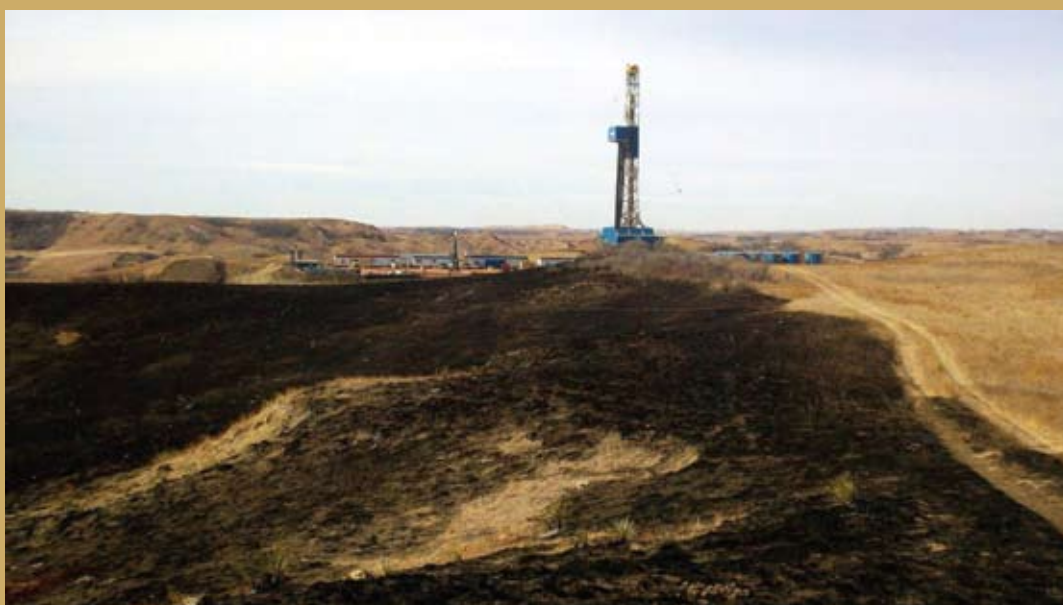
Oil rig and recent wildland fire.