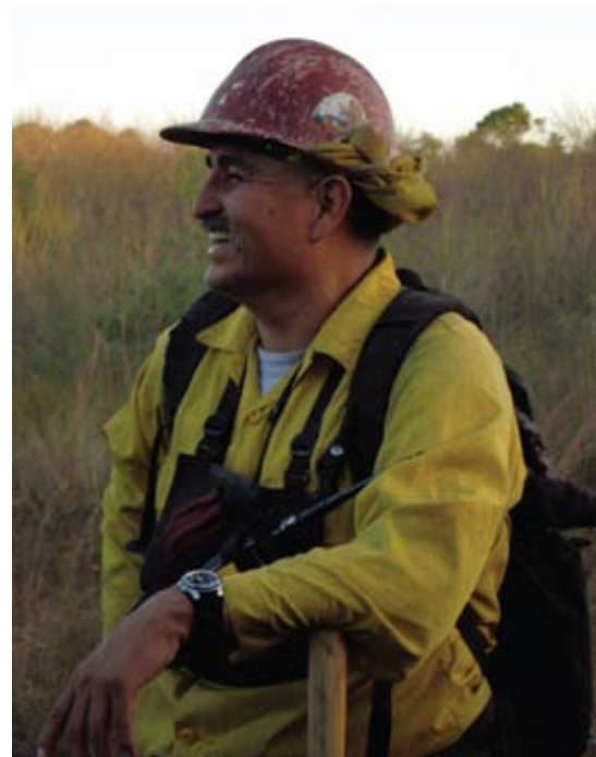
Observing a new "crop" of burners in Florida