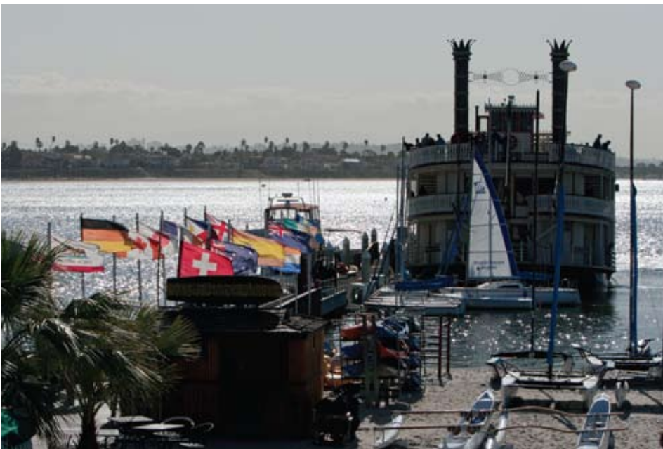
View from the conference hotel

We would like to express appreciation for all the presenters, moderators, facilitators and participants for making this meeting a success. As one evaluation form stated “Great Conference! 2006 Spokane, 2008 Albuquerque, 2010 Phoenix, 2012 San Diego, and 2014 Hawaii?” . It is not too early to start sending your input to Bill Downes regarding the next conference venue and theme.