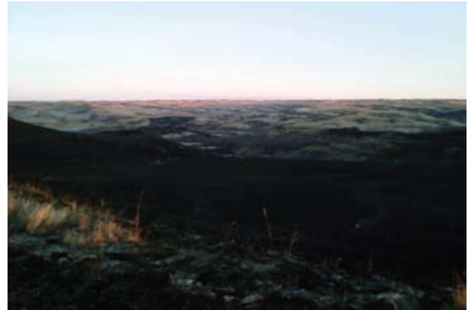
Lonefight fire, 600 acres.