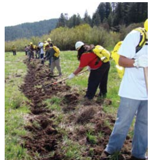
Greenville Rancheria fire crewmembers build fire lines alongside Forest Service firefighters and have trained hard to earn their place in agency dispatches to wildland fires.*