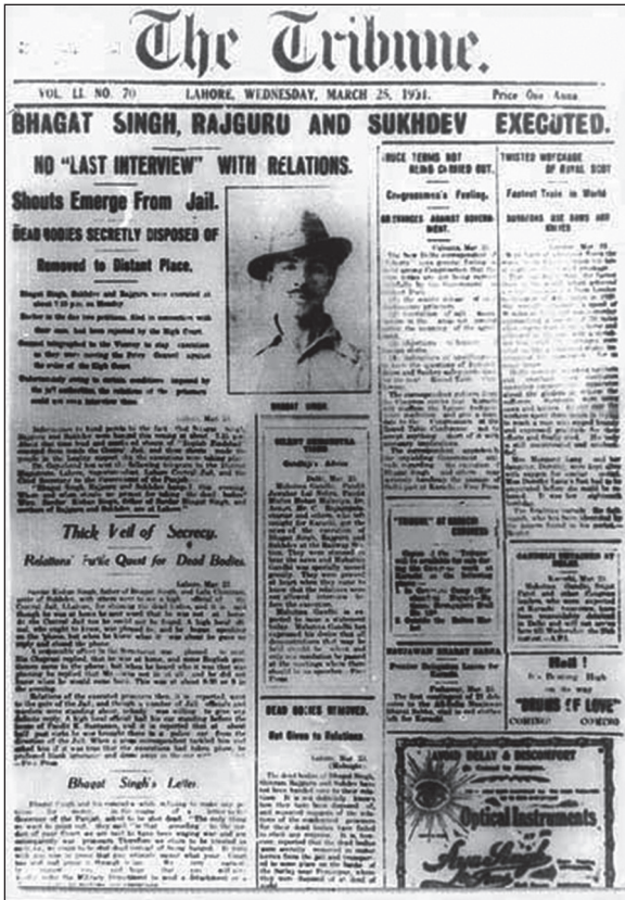
The headline of The Lahore Tribune, March 25, 1931. The article also claims that there were no last interviews with relations and that the bodies of Singh and his associates were secretly disposed of.