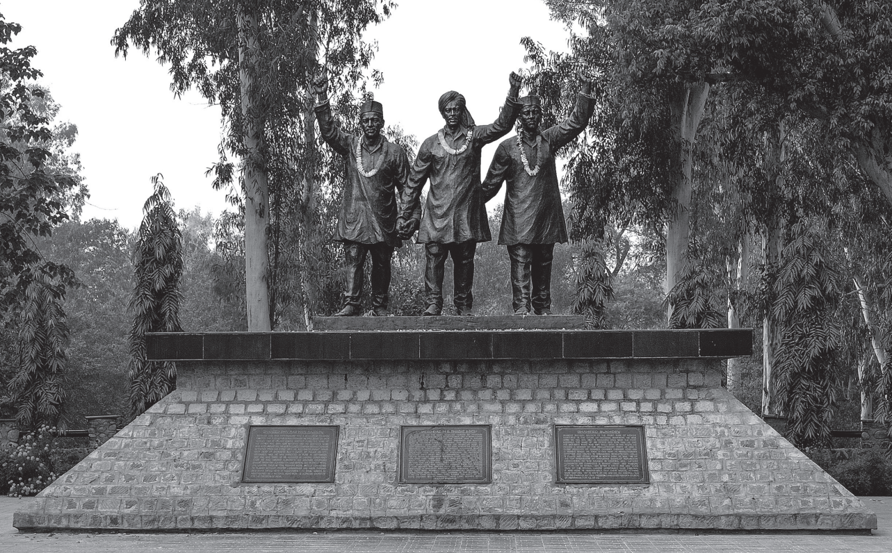
The National Martyrs Memorial in the Indian town of Hussainiwala on the Pakistani border with the Indian state of Punjab is a memorial for Bhagat Singh, Sukhdev, and Rajguru, who were cremated here in 1931 after their execution at the Lahore Jail.

Indian independence. Singh and Bose stoked the intense fear of the British authorities that a mass uprising similar to the events of the 1857 Sepoy Rebellion might occur, especially if a charismatic and determined individual emerged to lead it. 11 For the same reason that the British made every effort to keep Gandhi from dying while in their custody, they feared what Singh and Bose represented: the possibility that many, if not most, Indians would embrace violence and sweep away British power in India like a tempest, as was almost the case in 1857. Given the choice of suppressing a mass uprising characterized by horrific violence or negotiating patiently with Gandhi and his supporters in the Congress, the British authorities wisely chose the latter.