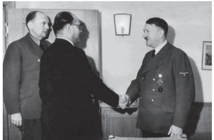
Top: Gandhi and Congress President Subhas Chandra Bose at the Indian National Congress annual meeting in Haripura in 1938.