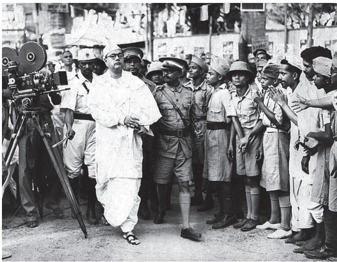
Subhas Chandra Bose arriving at the 1939 meeting of the All India Youth Congress (the central presidium of the Congress Party).

Bose returned to India convinced that only more forceful action by Indians and their leaders would bring about Indian independence. In 1938, his obvious passion