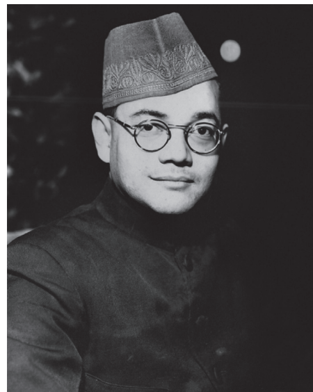
Subhas Chandra Bose.