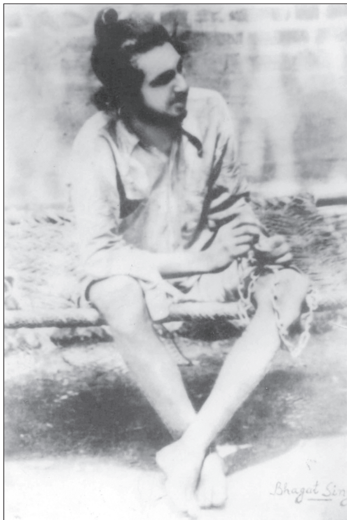
Bhagat Singh at twenty years old.

Singh went on to college in Lahore, which at the time was inhabited largely by Sikhs and there, despite acquiring the dress and the rhetorical style of an educated Englishman, flirted with what the British authorities labeled “revolutionary terrorism.” He eventually joined a small group dedicated to the cause of Indian independence that called itself the Hindustan Republican Association. Inspired by the methods of anarchists and communists who spread panic and fear throughout elite Western society during the late nineteenth and early twentieth centuries, Singh and his cohorts dreamed up schemes to singlehandedly bring down the British Raj. They collected weapons, learned how to make bombs, and made lists of targets and demands. In 1928, Singh and an accomplice shot and killed the British Assistant Superintendent of Police in Lahore. Singh managed to evade the police dragnet by donning a disguise, and within a few