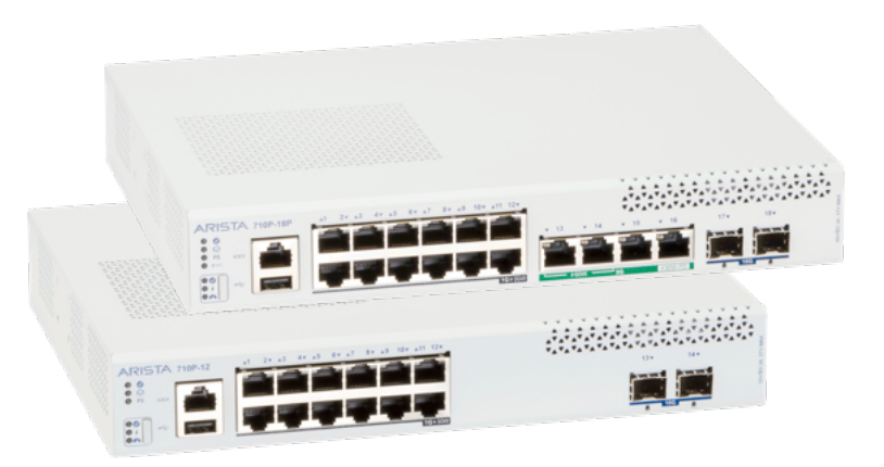
Arista 710P Series PoE Switches

The Arista CCS-710 fanless compact power over ethernet switch series was designed to extend the Cognitive Campus network into space-constrained and quiet environments such as conference rooms, retail showrooms, broadcast control rooms and small enclosures like ATMs. With multiple mounting options, the CCS-710 series switches are well suited for any deployment where sound and space are as important as reliable network operations.