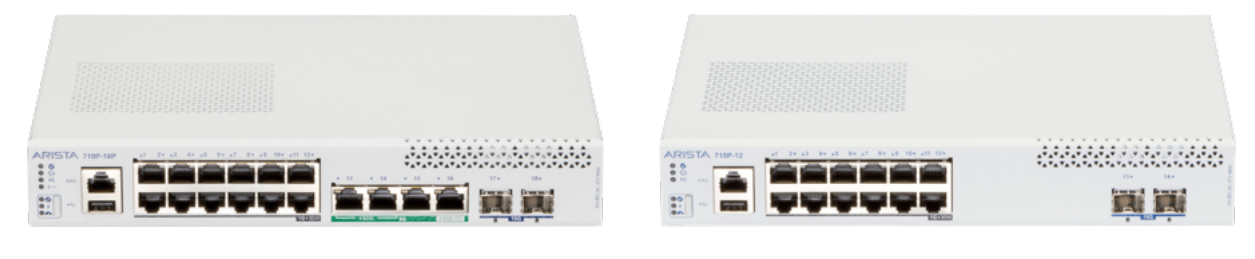
Arista 710P -16P Switch