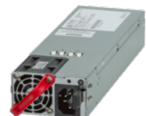
2.4kW Hot swap power supplies