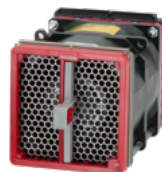
2U Hot swap fan modules