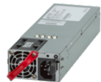
1500W Hot swap power supplies