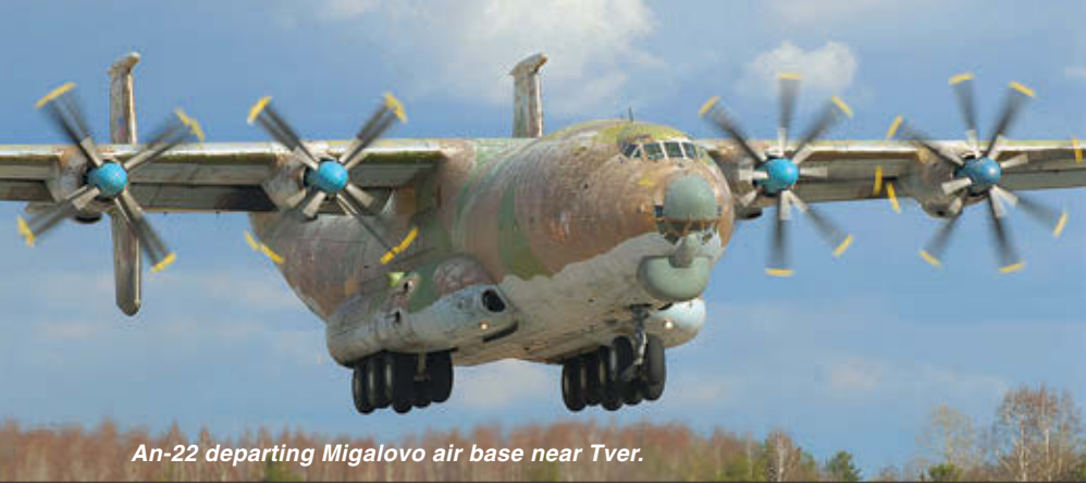
An-22 departing Migalovo air base near Tver.