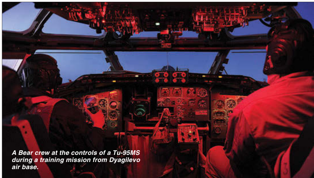
A Bear crew at the controls of a Tu-95MS during a training mission from Dyagilevo air base.