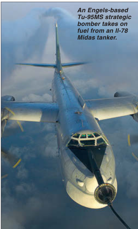
An Engels-based Tu-95MS strategic bomber takes on fuel from an Il-78 Midas tanker.