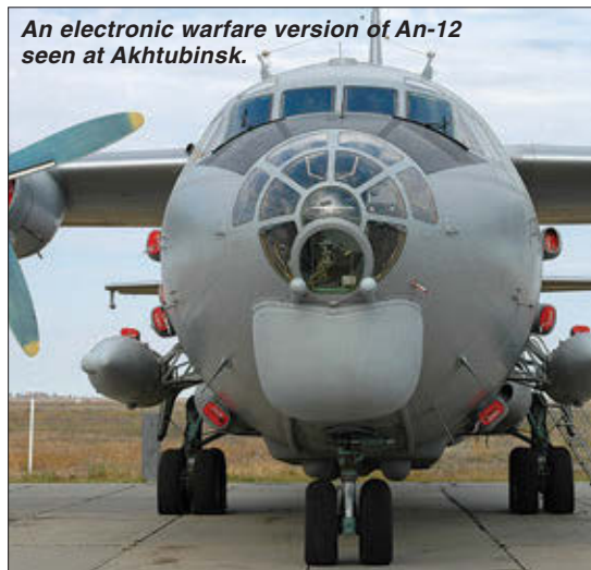
An electronic warfare version of An-12 seen at Akhtubinsk.