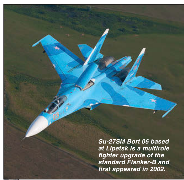
Su-27SM Bort 06 based at Lipetsk is a multirole fighter upgrade of the standard Flanker-B and first appeared in 2002.