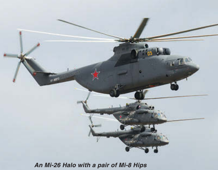
An Mi-26 Halo with a pair of Mi-8 Hips