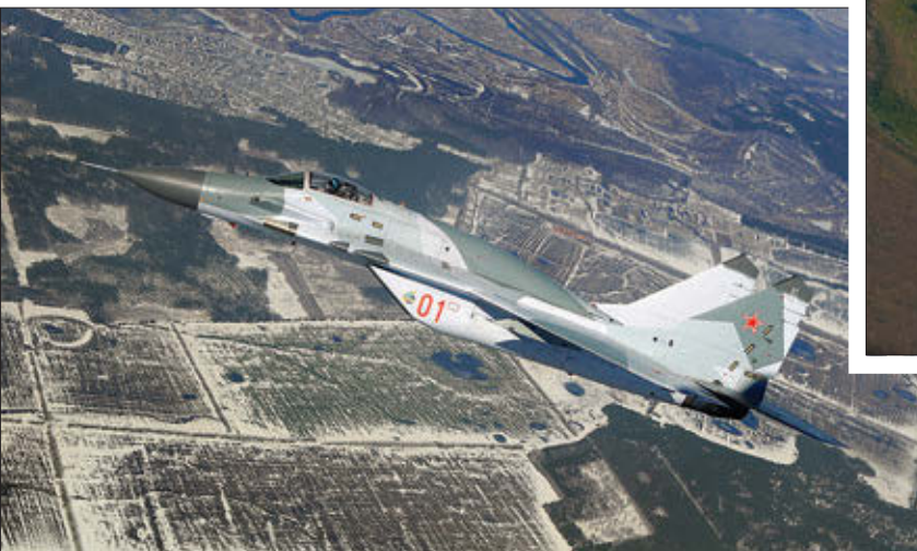
Above: The MiG-29SMT based at Lipetsk is an upgraded version of the early fighter, with new radar, avionics, inflight refueling, and increased fuel capacity (evidenced by the enlarged spine).