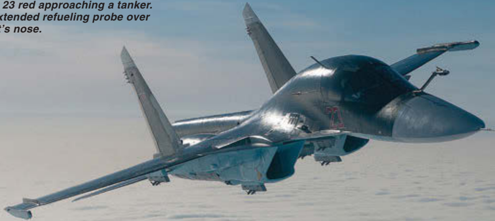
Su-34 Bort 23 red approaching a tanker. Note the extended refueling probe over the aircraft's nose.

The command also operates a flight of four Su-27 fighters deployed to Baranovichi air base in Belarus.