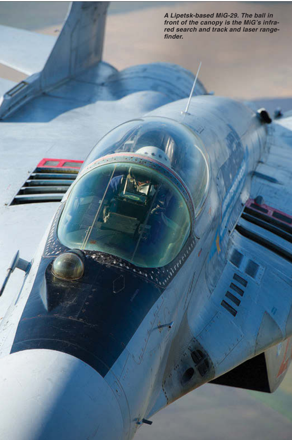
A Lipetsk-based MiG-29. The ball in front of the canopy is the MiG's infra-red search and track and laser range-finder.