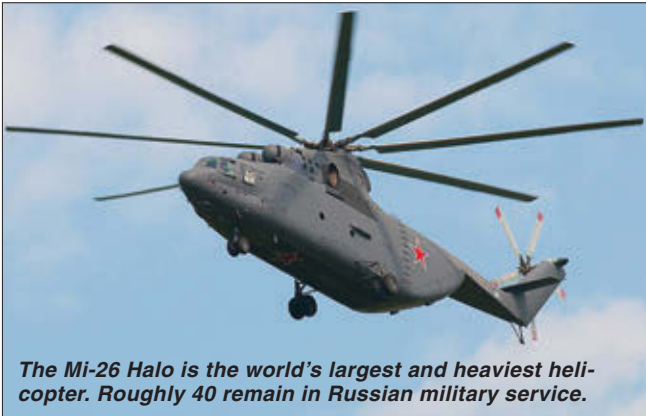
The Mi-26 Halo is the world's largest and heaviest helicopter. Roughly 40 remain in Russian military service.