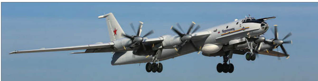
Above: This Tu-142MK Bear-F, Mod 3, is named for the city of Cherepovets and is based at Kipelovo. Right: An Il-20RT, based at Severomorsk-1. The aircraft originally tracked space launches but now serves as a regular transport.