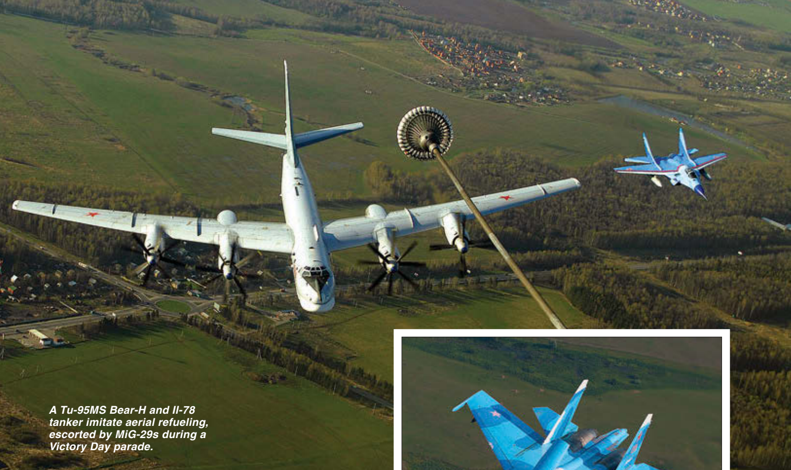
A Tu-95MS Bear-H and Il-78 tanker imitate aerial refueling, escorted by MiG-29s during a Victory Day parade.