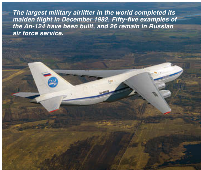
The largest military airlifter in the world completed its maiden flight in December 1982. Fifty-five examples of the An-124 have been built, and 26 remain in Russian air force service.