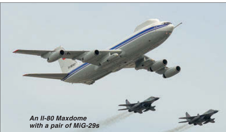
An Il-80 Maxdome with a pair of MiG-29s

Performance: speed 373 mph, range 3,850 miles, endurance 10 hours.