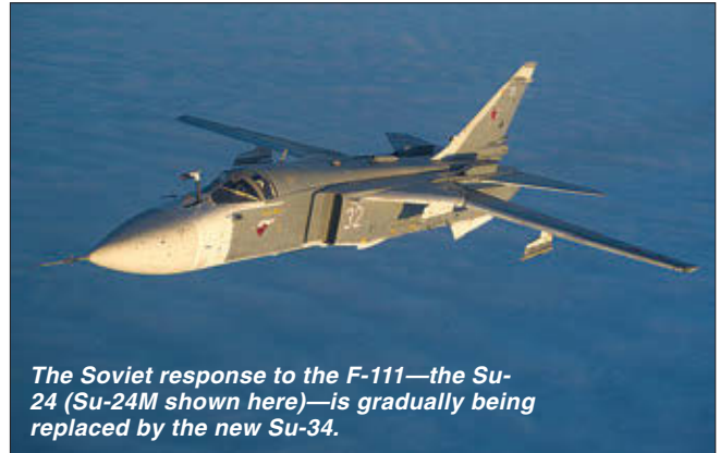
The Soviet response to the F-111—the Su-24 (Su-24M shown here)—is gradually being replaced by the new Su-34.