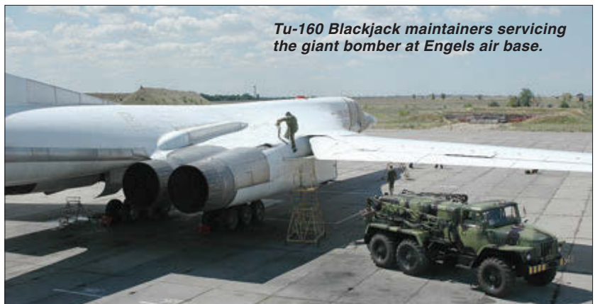
Tu-160 Blackjack maintainers servicing the giant bomber at Engels air base.