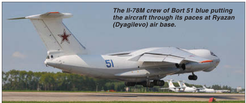
The Il-78M crew of Bort 51 blue putting the aircraft through its paces at Ryazan (Dyagilevo) air base.