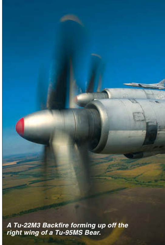
A Tu-22M3 Backfire forming up off the right wing of a Tu-95MS Bear.