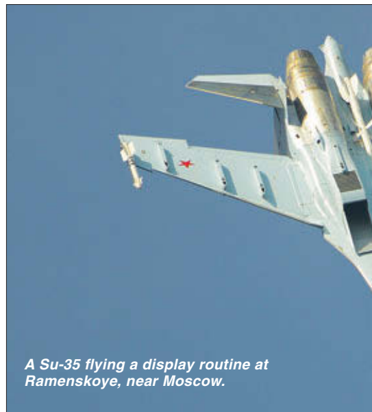
A Su-35 flying a display routine at Ramenskoye, near Moscow.