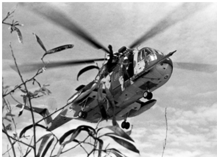
An HH-3E in action during the Vietnam War.