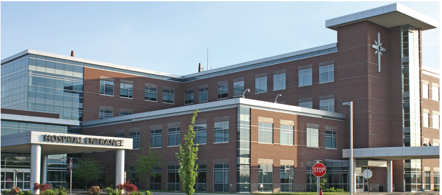
King's Daughters' Hospital

King's Daughters' Hospital | Madison, Ind.