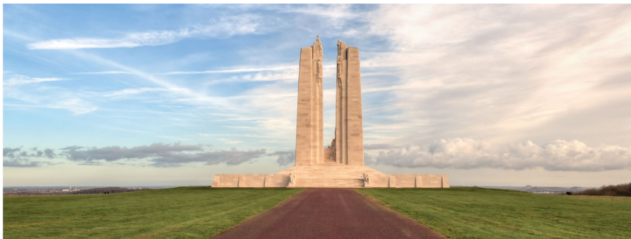
Walter S. Allward, Vimy Memorial, 1921–36.

Although Walter S. Allward shared the same virtuoso talent as Michelangelo, the visionary artist behind Canada's iconic Vimy Memorial was nearly forgotten for many years. Now, on the anniversary of the battle that he famously commemorated, a new book documents the revered sculptor's life and career.