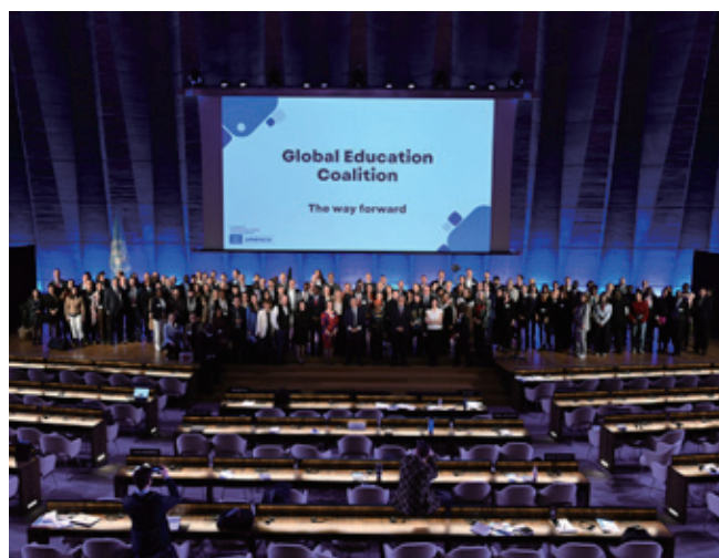
Global Education Coalition Annual Meeting in 2023

COVID-19 has also put a spotlight on the employment and skills divide, with recovery patterns that vary significantly across regions, countries, and sectors. According to the International Labour Organization (ILO), the repercussions have been grave in particular for the youth. In many countries is a cause for concern, with a significant prevalence of informality and vulnerable employment among employed youth worldwide. Additionally, when young individuals are not engaged in employment, they encounter challenges in accessing the labour market. Not only that, but entering and staying in the workforce in such a competitive market is extremely difficult, resulting in high rates of youth unemployment and NEET (not in employment, education, or training). This difficulty in transitioning from school to work has prompted the international community to address the issue within the framework of the 2030 Agenda for Sustainable Development. SDG8, and target 8.6 specifically, commits to increasing youth employment opportunities and substantially reducing the proportion of youth who are not in education, employment, or training (ILO, n.d.; United Nations, 2015).