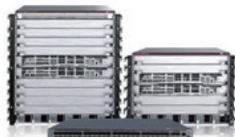
CloudEngine S-series Campus