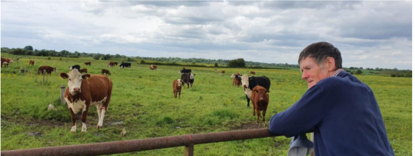
A bit of activism is my rent for staying on the Planet

I could continue to lean over the gate and talk to the cows and calves which has been quite therapeutic this last year.