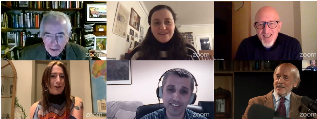
The speakers from the 'Conversations on Alternatives' webinar series

Tuning into the news while being in isolation is awful. Watching as military coups, warnings of genocide and famine and learning of the protracted crisis and pockets of refugee camps that we share the planet with is heart-breaking. Feelings of disillusionment took over as I waited for the Security Council's response. That's "just the way the world is" people would tell me.