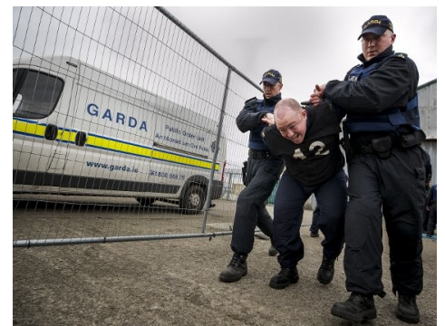
Ireland's two police forces are taking part in an EU-funded project alongside Israel's "torture ministry."