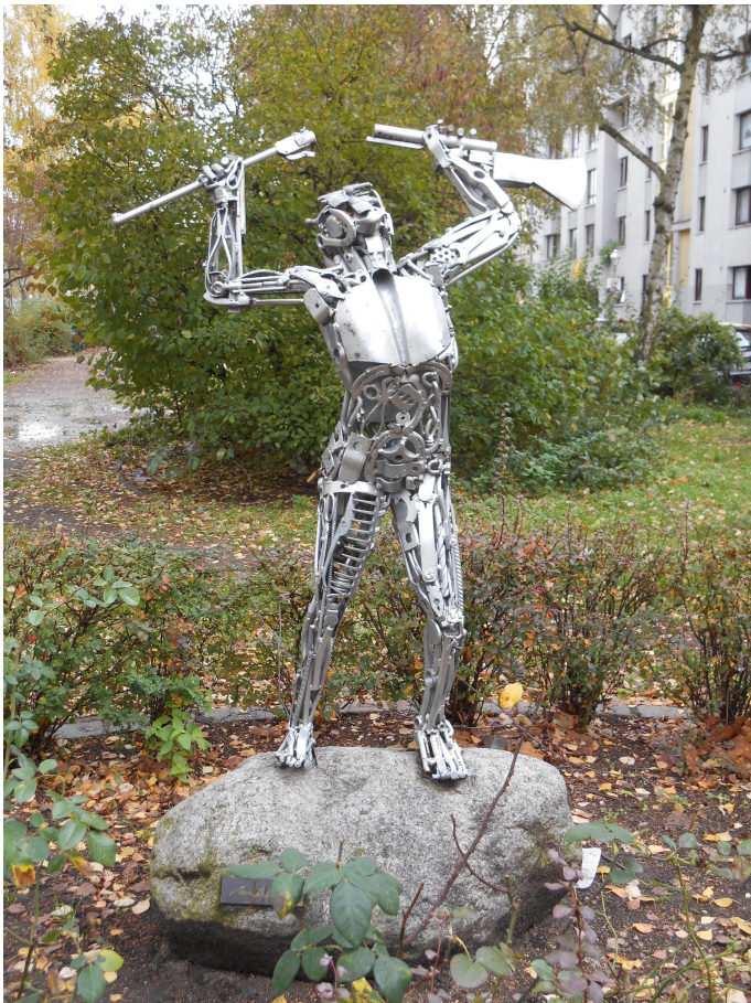
The Broken Rifle - Symbol of war resistance since 1921

Remember that there's never been a wall that someone didn't build or a border that was anything but abstract, think about how there's never been a noose that no one fashioned and remember that on both ends of all this infrastructure there are only humans; it is us that's doing this