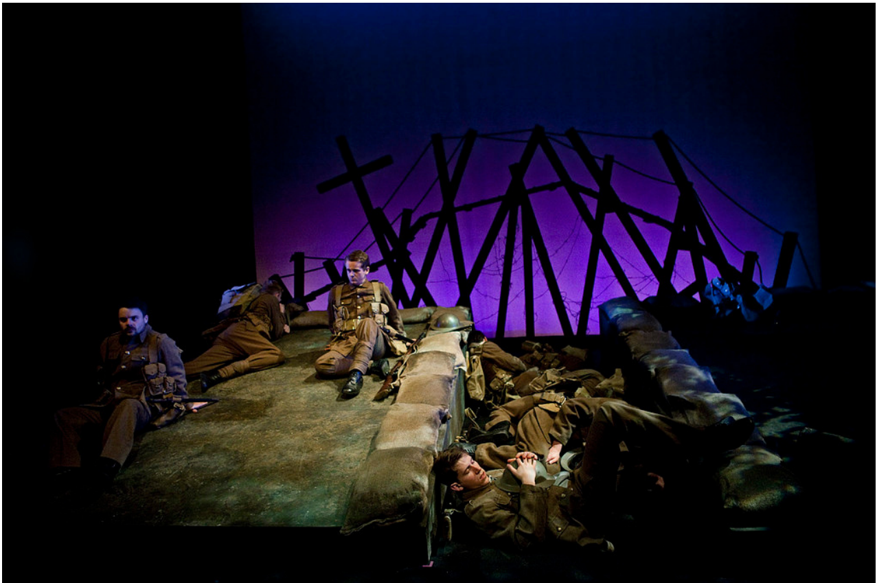
Scene from Frank McGuinness's 'Observe the Sons of Ulster Marching towards the Somme'