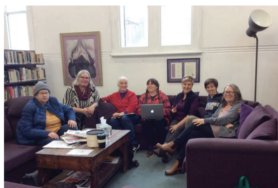
Women Write Wiki June 2019