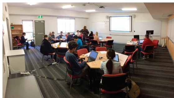
Training: Editing with Visual Editor at ANU