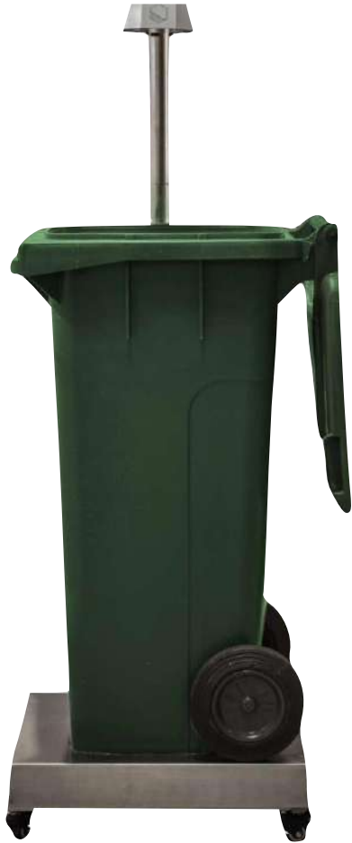
Measure with Ease