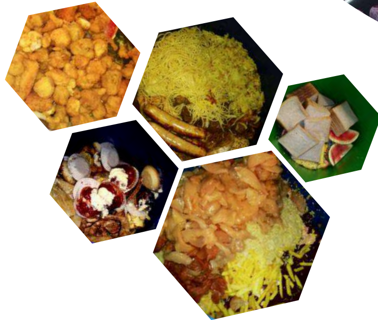
Identify with AI