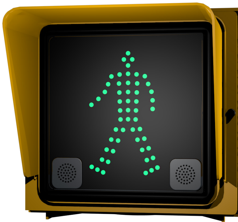
Photo Credit: PassBlue™ Smart Traffic Light System , ILUNION Consulting, ONCE Foundation

Building on the success of these initiatives, the ONCE Foundation is planning to expand the personalization of digital terminals to a range of other devices. These technologies support the Foundation's tireless work to improve tourism accessibility over the past 20 years.