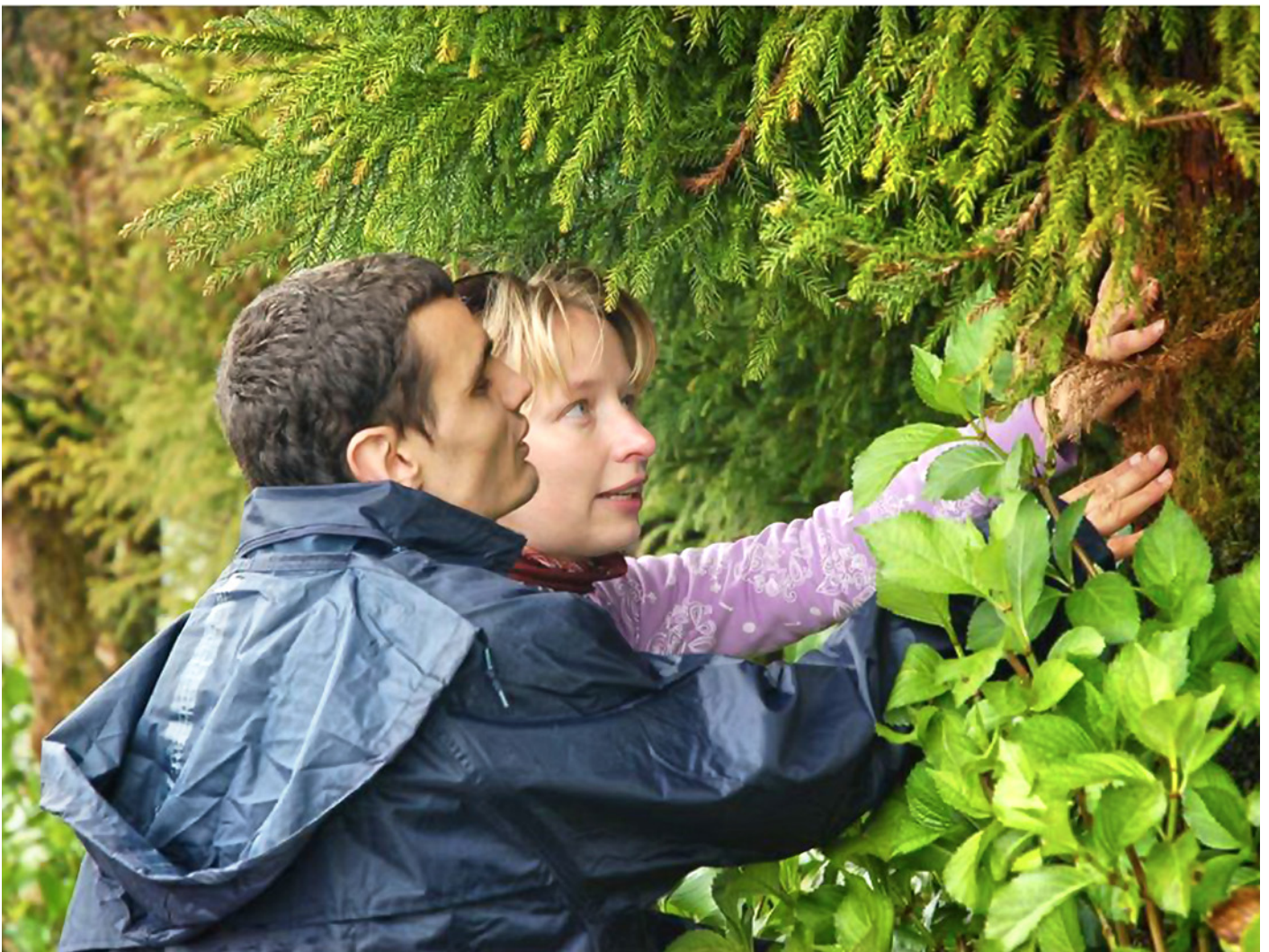
Amphibian Chair (left) and Tactile Guided Tours for the Blind

Action Plan. Its guidelines are a useful starting point for destinations seeking to invest in accessibility. These recommend: integrated programmes to make facilities accessible, training and awareness-raising, accessible information on infrastructure and services and fostering conditions that equip service providers to receive tourists with disabilities.