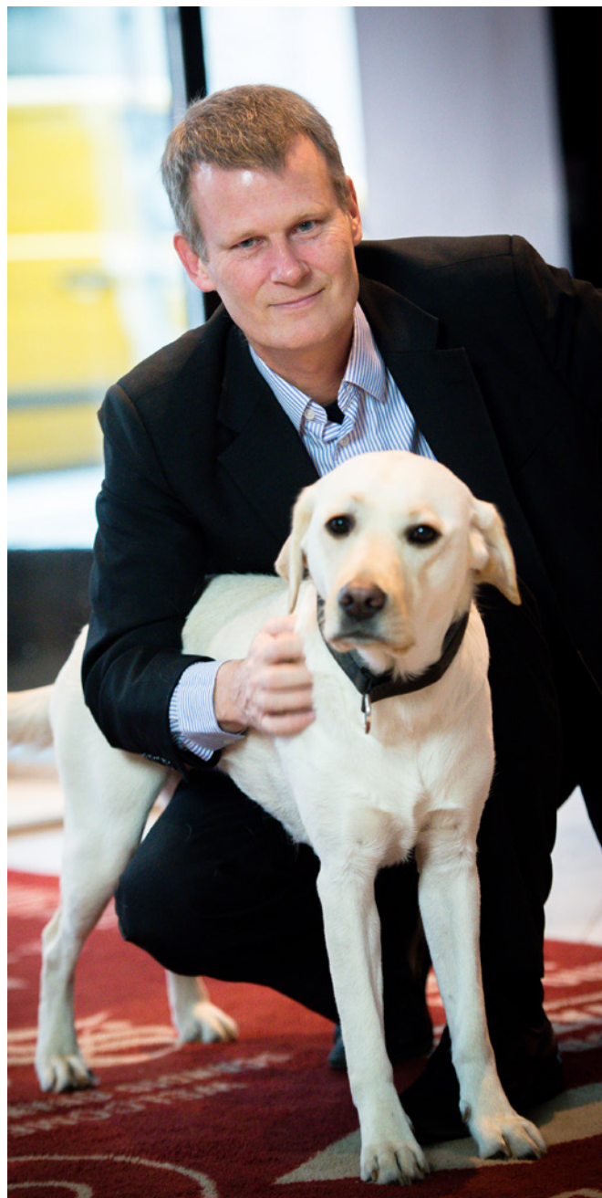
Photo Credit: Magnus Berglund and Dixi the Guide Dog , Scandic Hotels

For example, the provision of information via the hotel's website involves no extra costs. Providing guests with such accessible facilities as walking stick holders, which only cost a Euro each, is another example of affordable measures to enhance accessibility.