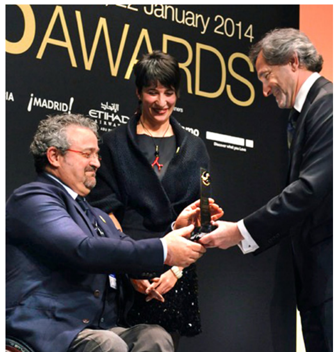
Photo Credit: V4AInside receives the 2nd Runner-Up Award for Innovation at the 2014 UNWTO Ulysses Awards, Village For All

The easy-to-use application can be accessed on a tablet or iPad in Italian, English and Portuguese. To provide truly comprehensive possible, its data is integrated with other data collection systems, such as quality certification, star ratings and environmental classification.