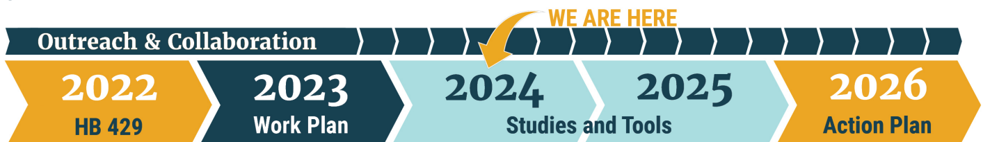
Figure A-1. GSLBIP schedule

After the release of the Work Plan Foundation document, the Office of the Great Salt Lake Commissioner released its first-ever Great Salt Lake Strategic Plan. The strategic plan intends to provide a balanced approach to water management in the Great Salt Lake Basin that protects the health and sustainability of Great Salt Lake. The GSLBIP will provide information and tools to improve water management decision-making in the Great Salt Lake Basin, supporting future planning and the implementation of the strategic plan. Throughout the development of the GSLBIP, the Office of the Commissioner will provide direction and guidance to the GSLBIP project team.