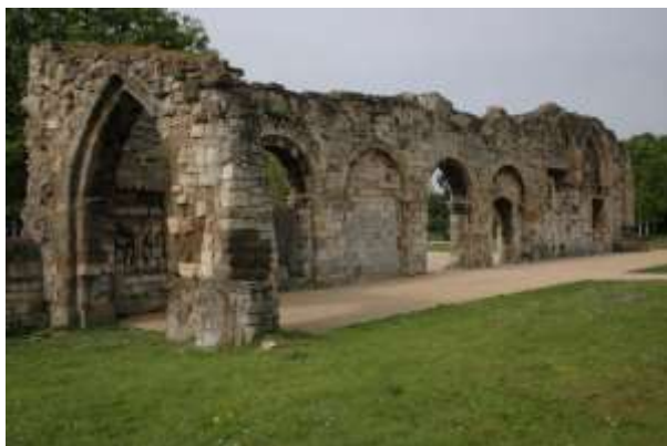
Figure 4 | Twelfth and thirteenth century arches of St Oswald's Priory, Gloucester, where Æthelflæd and Æthelred were buried

Æthelflæd died at Tamworth on 12 June 918 and her body was carried 75 miles (121 km) to Gloucester, where she was buried with her husband in their foundation, St Oswald's Minster. [17] According to the Mercian Register, Æthelflæd was buried in the east porticus . A building suitable for a royal mausoleum has been found by archaeological investigation at the east end of the church and this may have been St Oswald's burial place. Placement next to the saint would have been a prestigious burial location for Æthelred and Æthelflæd. William of Malmesbury wrote that their