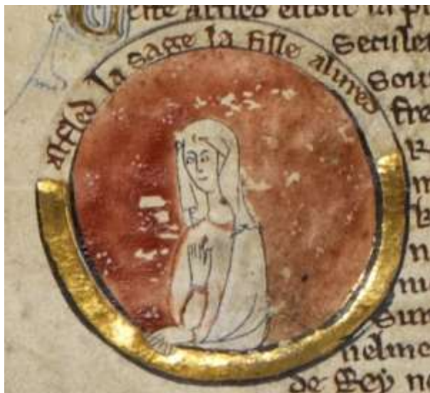
Figure 5 | Æthelflæd in the thirteenth century Genealogical Chronicle of the English Kings, Royal MS 14 B V PD-Art-PD-old-100