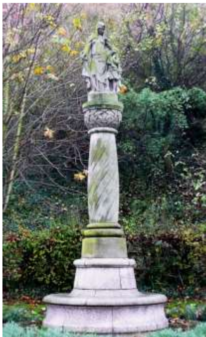
Figure 3 | Statue in Tamworth of Æthelflæd and her nephew Æthelstan, erected in 1913 to commemorate the millennium of her fortification of the town [52]

Æthelflæd had already fortified an unknown location called Bremesburh in 910 and in 912 she built defences at Bridgnorth to cover a crossing of the River Sever. [17] In 913 she built forts at Tamworth to guard