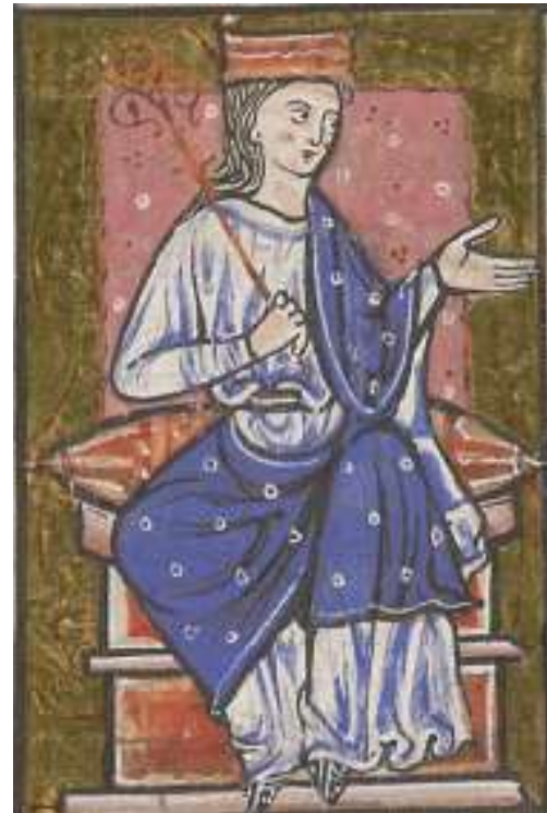
Figure 1 | Æthelflæd (from The Cartulary and Customs of Abingdon Abbey, c. 1220