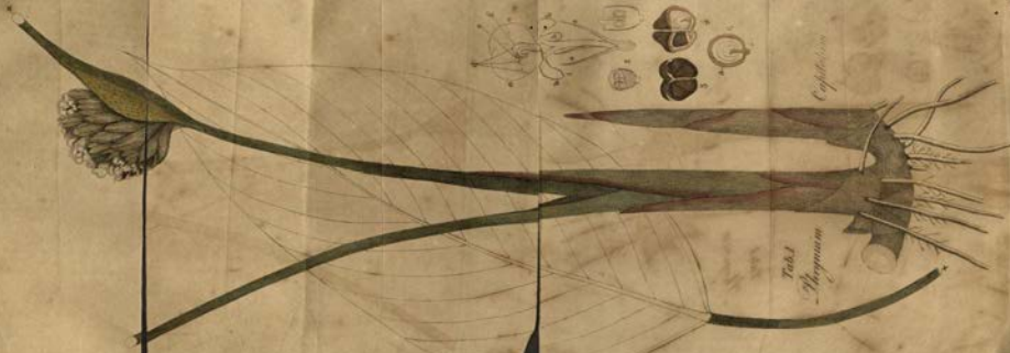
Tab. I Thymum