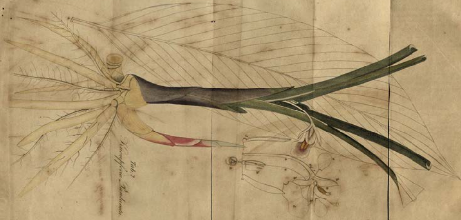
Tab. 2. Macropisium - Randuaria.