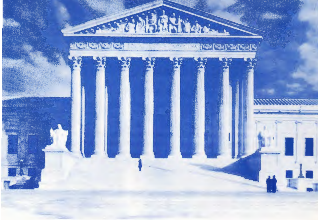
THE SUPREME COURT OF THE UNITED STATES