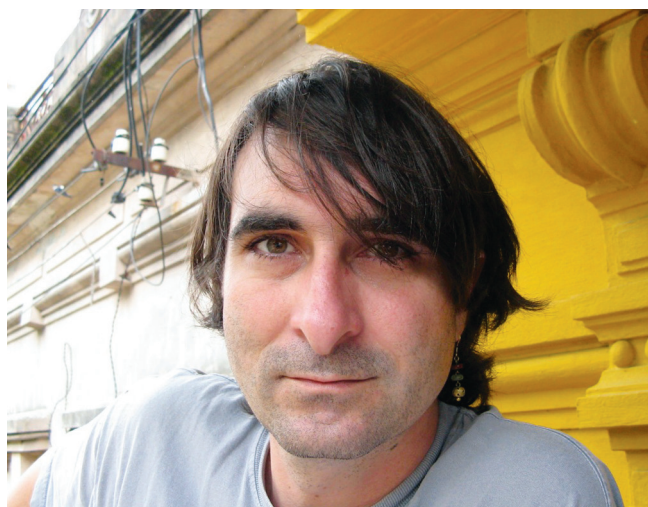
(CC-BY 3.0) by Ofelia Ros

It exceeded expectations in just about every area. I was perhaps most surprised by how much this also became an assignment about writing (and revising).