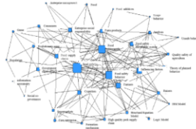
Figure 1. Social network visualization structure map of high-frequency keywords.