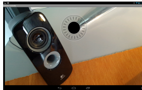
Figure 1: The handheld device displays a clickwheel-like interface for controlling the volume level of a loudspeaker.

To identify objects in the view of the mobile device, we apply visual classification techniques to extracted local image features that describe the appearance of an object. As features, we chose speeded up robust features (SURF)