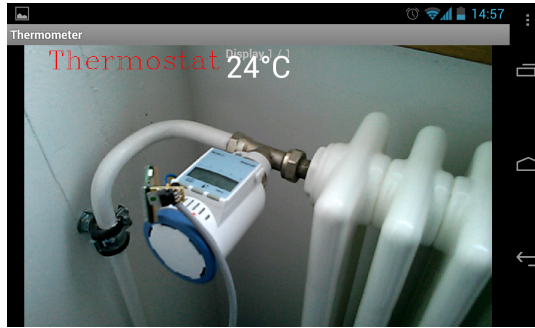
Figure 2: Displaying the ambient temperature sensed by a smart thermostat.