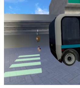
c. AV with projected zebra