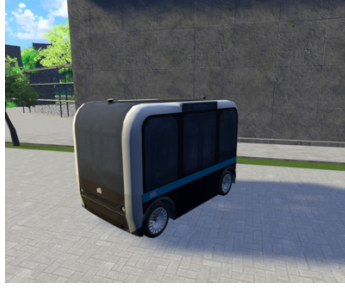
a. AV without eHMI