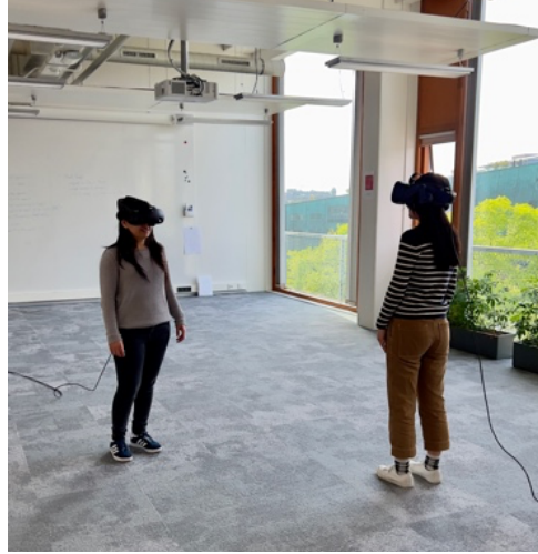
Figure 4. Illustration of two persons wearing two Virtual Reality headsets.

In the current study, we utilized the real-walking locomotion style, allowing users to have continuous motion regarding movements and rotations in the real world, which can be matched under a 1:1 scheme to the virtual environment. Participants were able to move in the real-life environment under a 1:1 scheme mapped to the virtual environment. Literature shows that real-walking locomotion enables more realistic, natural walking movement, and leads to a higher sense of presence compared to other locomotion styles [42–44].