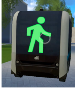
b. AV with pedestrian-sign