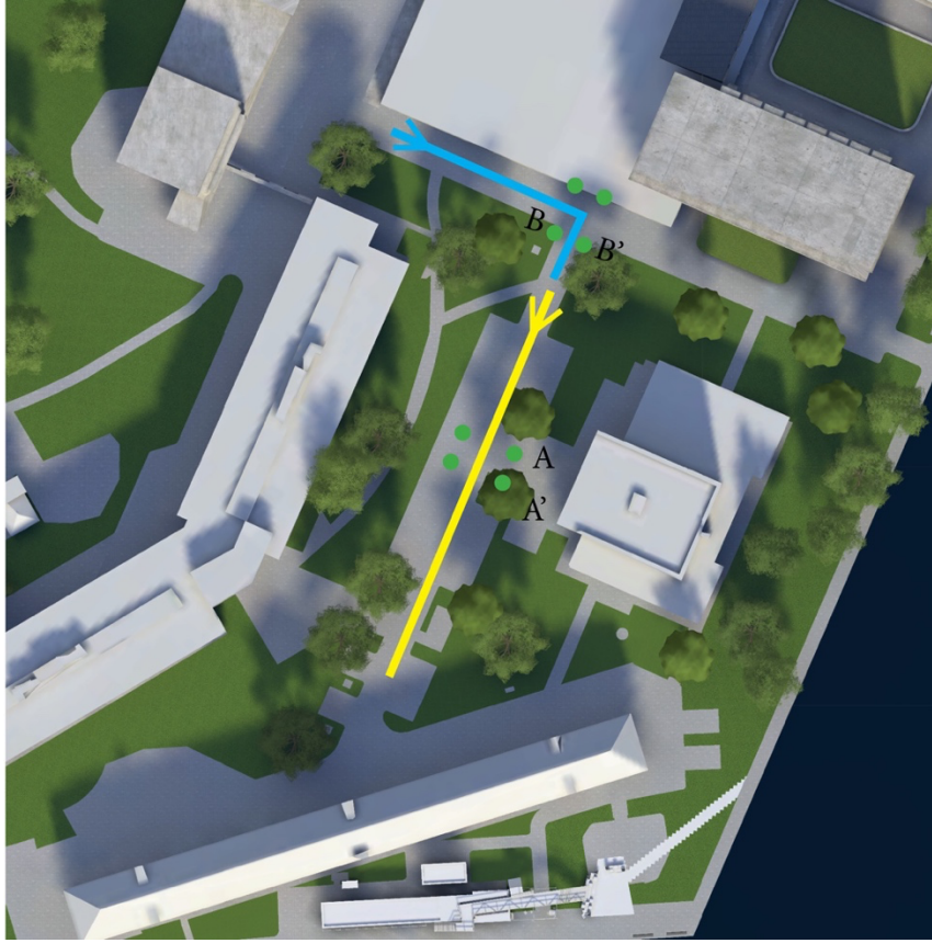
Figure 1. The top view of the virtual environment (the blue line is the T-junction path, the yellow line is the straight path, and green circles are the start and end positions of pedestrians).

Type of path: According to the study objective, two main paths and their surrounding areas were chosen as the experimental environment, including one straight path (yellow line in Figure 1) and one T-junction path (blue line in Figure 1). In all scenarios, the AV drove on the predefined path and operated according to specified driving behavior, mimicking the desired vehicle behavior of an AV. The arrows in Figure 1 indicate the approaching direction of the AV on both paths. For the T-junction path scenario, the AV indicated its turning intention by showing the turning light on. In the straight path scenarios, the AV approached the pedestrians from the right side of the participants; and in the T-junction path scenario, the AV approached the pedestrians from the left side of the participants.