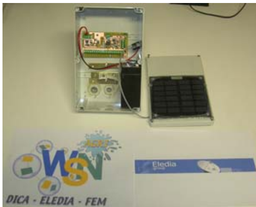
Figure 1 – Prototype of a WSN node

This paper describes a WSN-based system for precision agriculture. Such an installation is characterized by totally autonomous nodes equipped with a set of multiple sensors to collect data concerned with environmental parameters as well as with the status of the apple trees. The preliminary validation of the network confirmed the effectiveness of such a system and the feasibility of the precision farming by means of WSN. The long run use of the system will certainly provide useful data and suggestions to complete a closed-loop solution for production management.