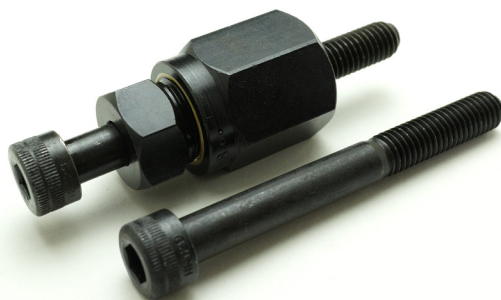
M8 Nutsert installation tool