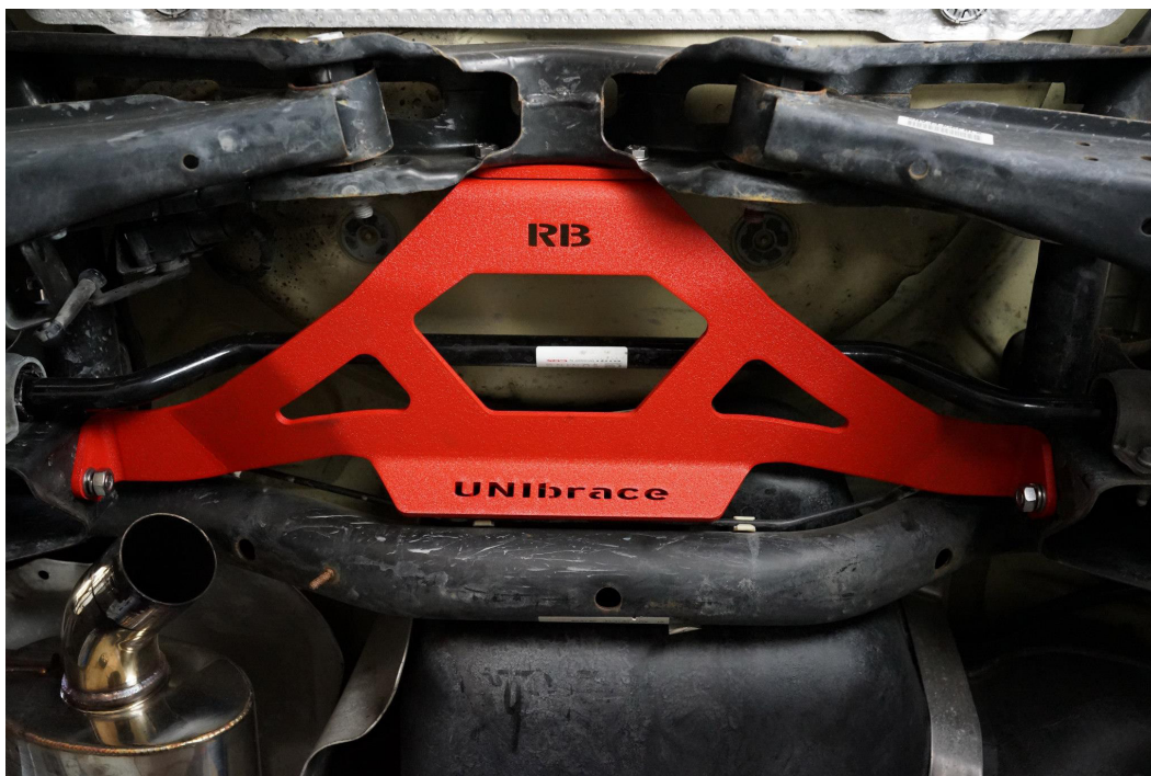
Brace in place without rear portion of exhaust. (Above) Completed installation (Below)