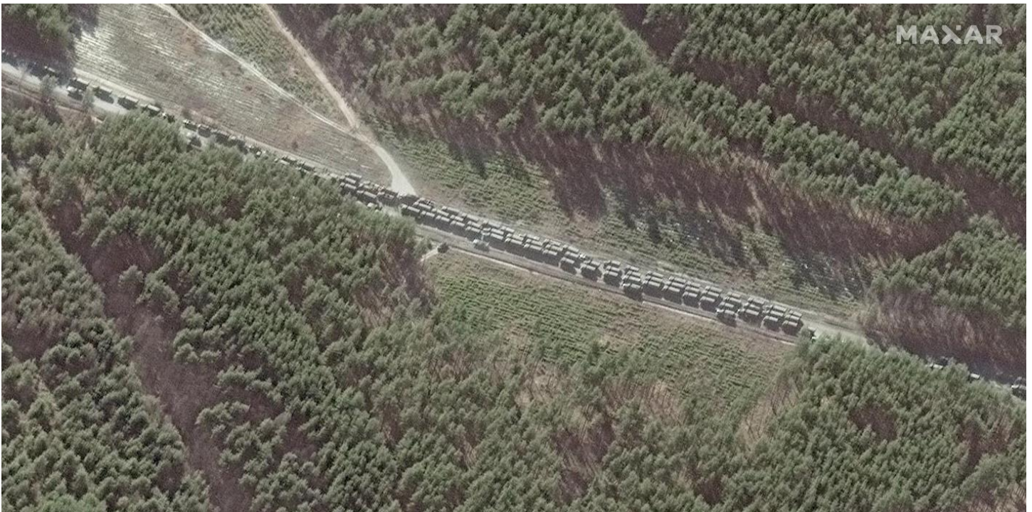
Satellite image ©2022 Maxar Technologies.