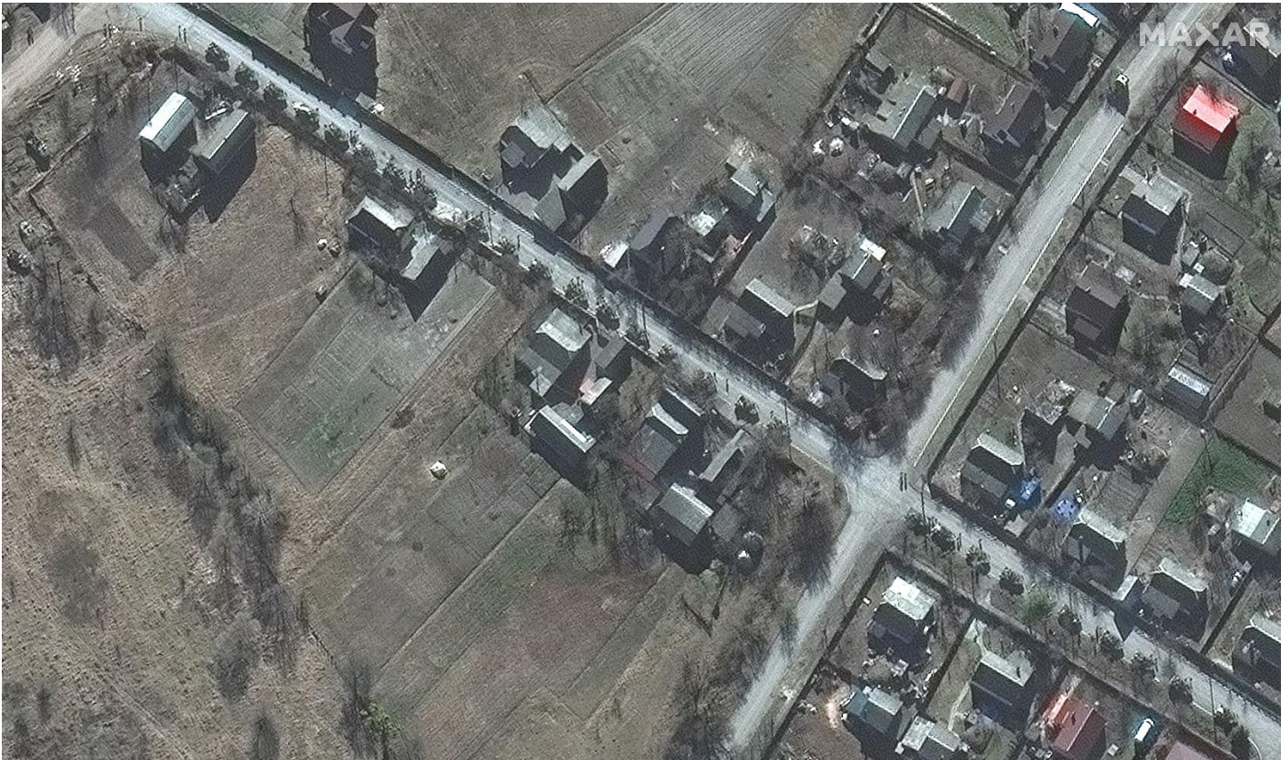
Satellite image ©2022 Maxar Technologies.