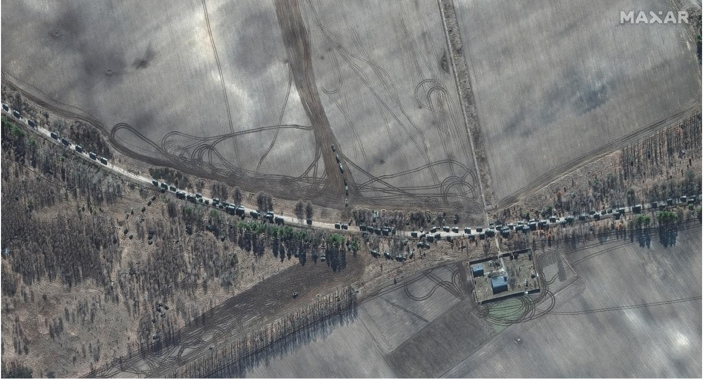
Satellite image ©2022 Maxar Technologies.