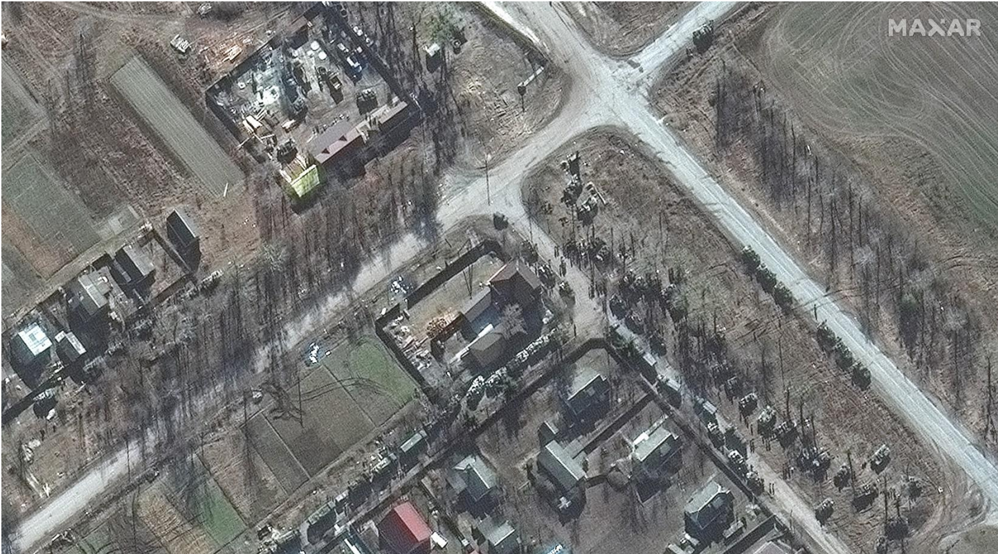
Satellite image