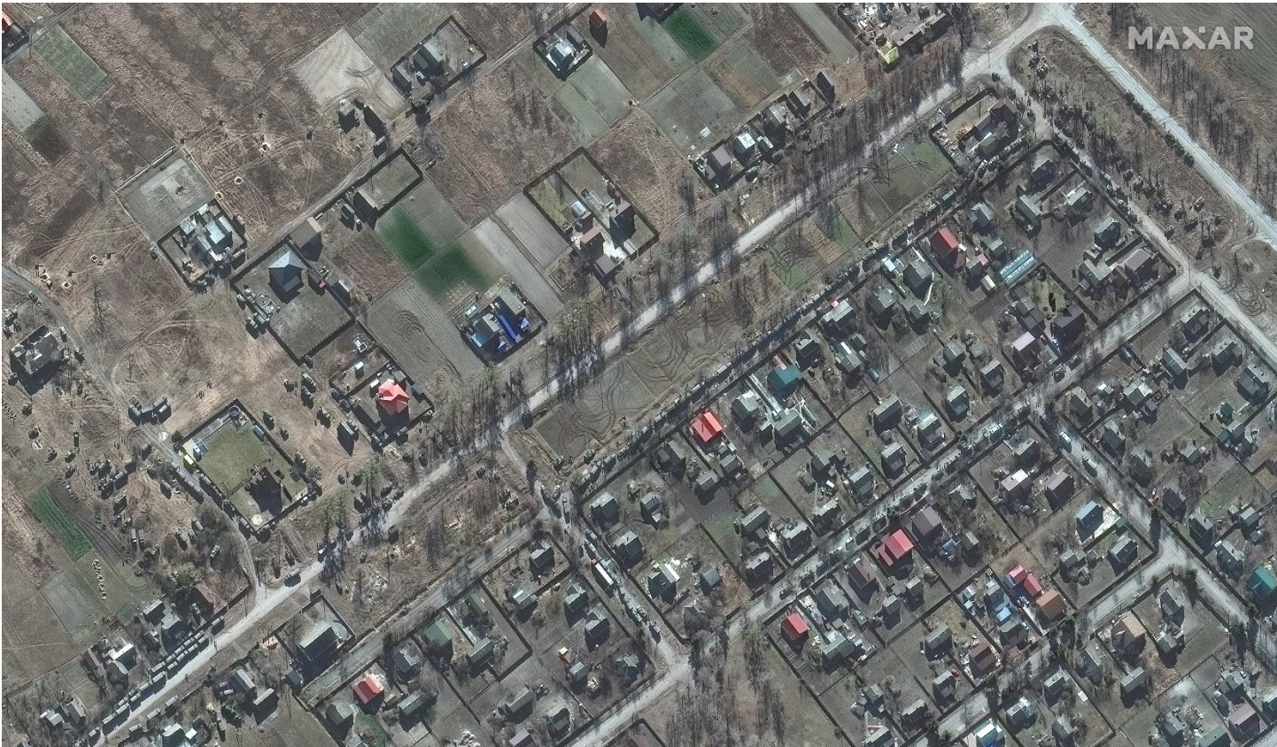
Satellite image