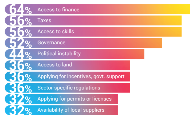
Figure 2. Top 10 issues faced by surveyed investors in their current operations in LDCs

Investors are eager to connect with domestic suppliers and partners, providing IPAs an opportunity to support them in this area. Nearly a third of respondents cited “availability of local suppliers and partners” as an issue. IPAs can have a role in connecting investors to actors in the local economy and forge supplier relationships or technical and financial partnerships.