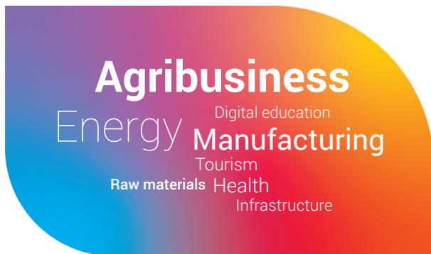
Figure 1. Top sectors mentioned as emerging opportunities by surveyed investors in LDCs (larger = more mentions)