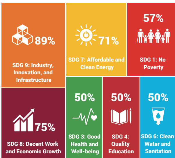
Figure 4. SDG priorities most cited by surveyed LDC IPAs

targeted for investment included agribusiness, manufacturing, tourism, energy, infrastructure, and ICT and IT-enabled services. While half of the IPAs responded that they prioritized SDG 3 on good health and well-being and SDG 7 on quality education , these were not amongst their priority sectors to attract investment.