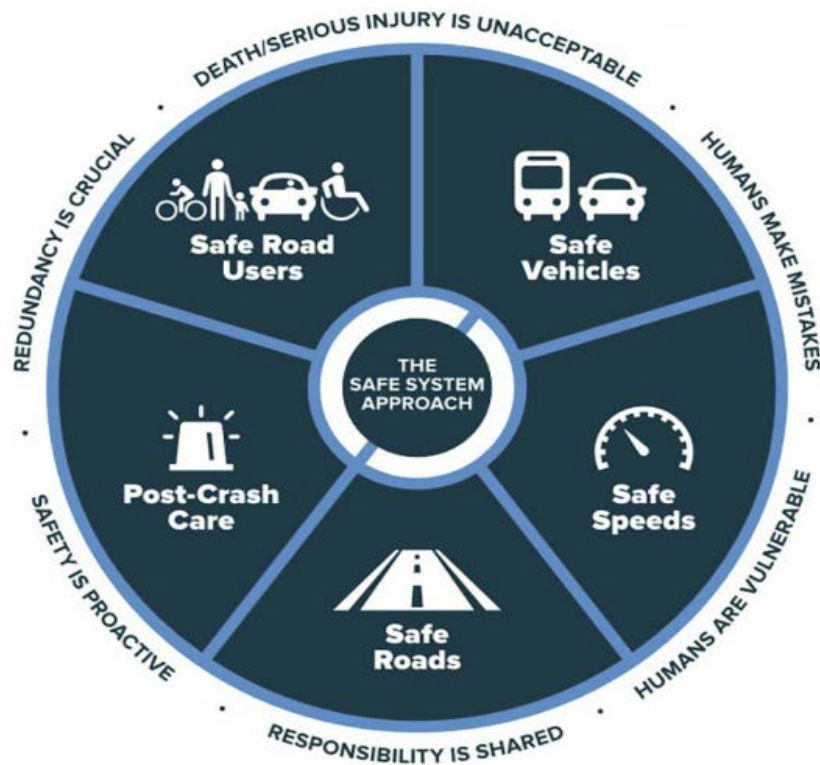
Chart 3. The Safe System Approach