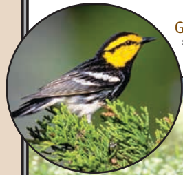
Golden-cheeked warbler

During the days of the dinosaurs, this area looked very different. A vast shallow sea covered the area. The Glen Rose area was a Cretaceous age coast with beaches, lagoons and coral reefs. Large tropical palm and conifer trees grew along the shore. Shells of crustaceans from this sea left calcium carbonate deposits that made the limestone you see today and created the special “limey” mud that preserved the tracks of the dinosaurs.