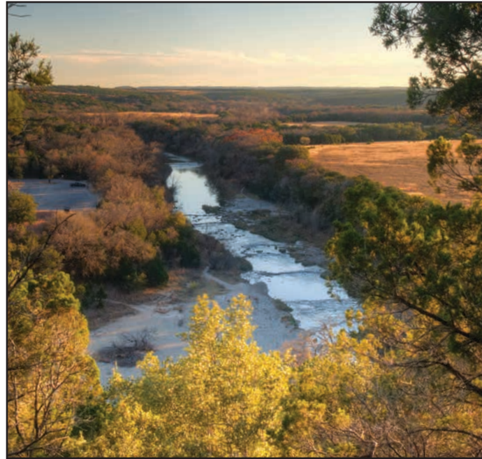
CHASE A. FOUNTAIN, TPWD