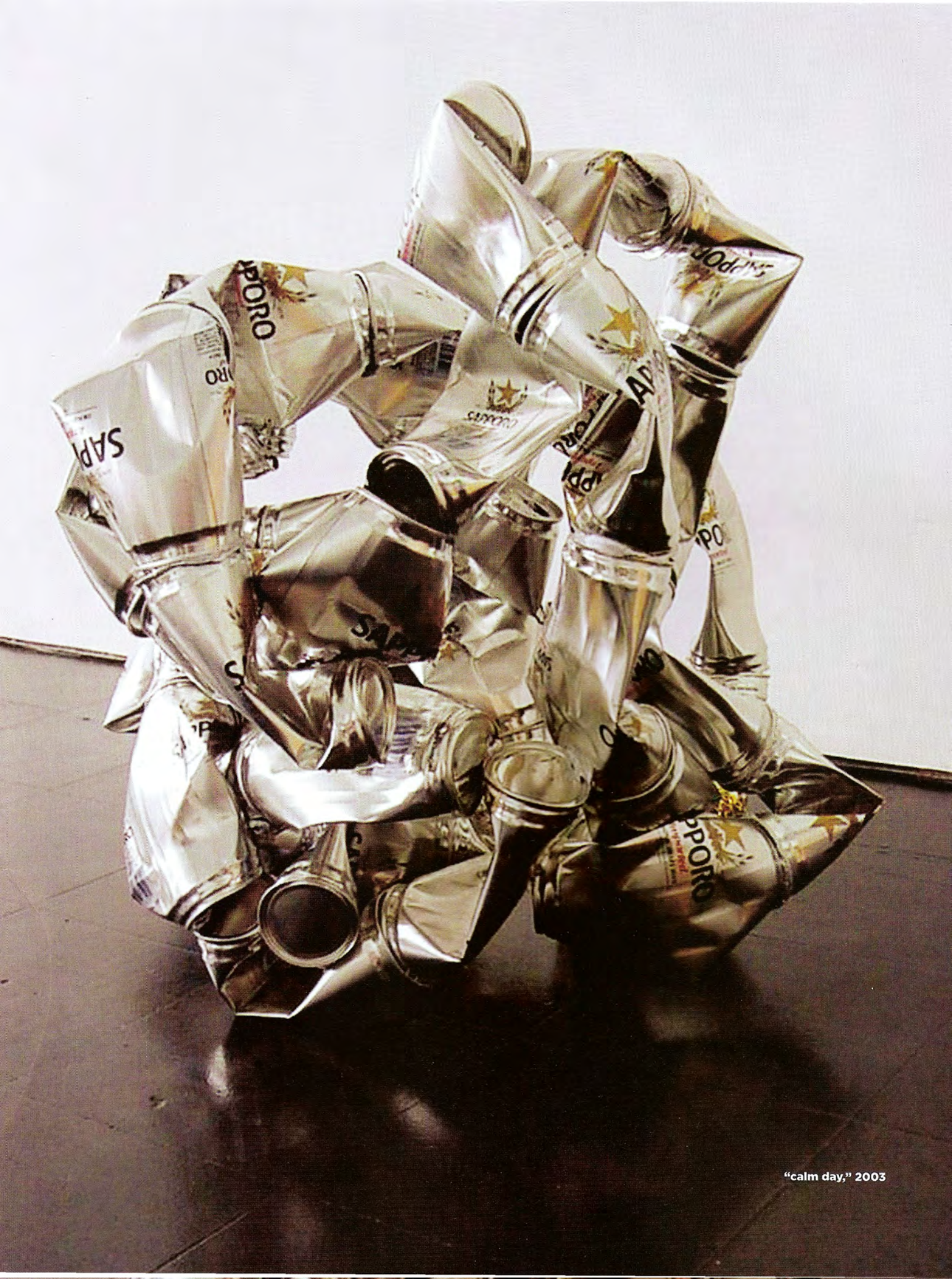
"calm day," 2003