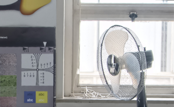
(a) HDR from densely sampled LDR images