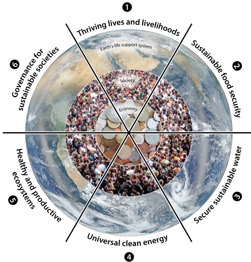
Figure 1 | Six universal Sustainable Development Goals cutting across economic, social and environmental domains.

Published in Nature 495, 305–307 (2013); http://dx.doi.org/10.1038/495305a .