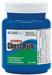
Vapor Rub, 3.5 oz. Count: 1