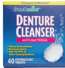
Denture Cleaning Tablets Count: 40