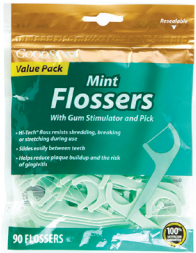
Interdental Flossers Count: 90