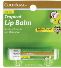
Medicated Lip Balm, 0.15 oz. Count: 1