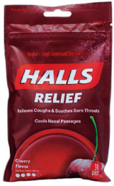
Cough Drops, Halls® Count: 25