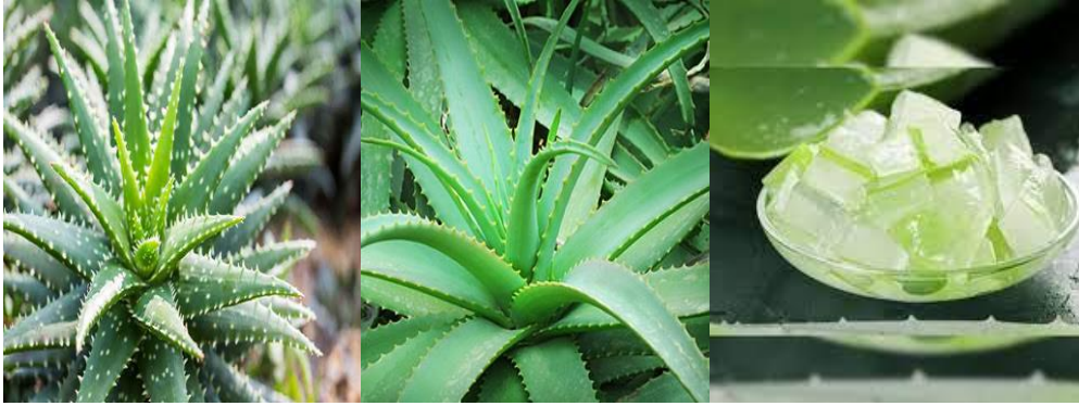
Figure 1: Aloe vera plant and Aloe vera gel [11]

Aloe vera is a stemless or very short-stemmed plant growing to 60–100 centimetres (24–39 inches) tall, spreading by offsets [12]. The leaves are thick and fleshy, green to grey-green, with some varieties showing white flecks on their upper and lower stem surfaces [13]. Aloe vera leaves contain phytochemicals under study for possible bioactivity, such as acetylated mannans, polymannans, anthraquinone C-glycosides, anthrones, and other anthraquinones, such as emodin and various lectins [14]. Aloe vera can lead to skin integrity, moisture retention, erythema reduction, and helps to prevent skin ulcers [15].