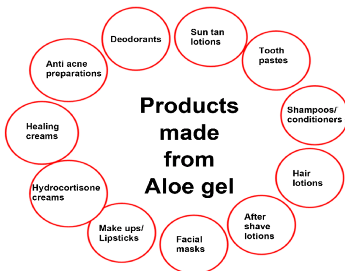
Fig 3: Aloe gel made different cosmetic products [58]

It is used as base material for the production of creams, lotions, soaps, shampoos, facial cleansers and other products. In the pharmaceutical industry, it is used for the manufacturing of topical products such as ointments and gel preparations, as well as in the production of tablets and capsules dried aloe gel has been successfully used to manufacture directly compressible matrix type tablets.