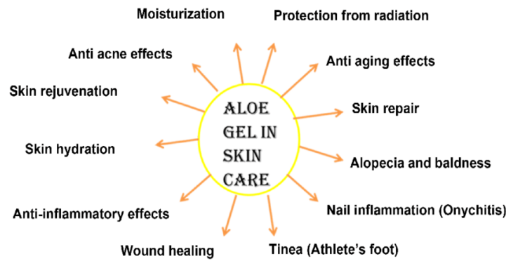
Fig 2: Use of aloe gel in skin care. [61, 62]

salves. The gel contains an emollient polysaccharide, glucomannan. It is a good moisturizer [30].