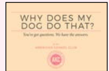
WHY DOES MY DOG DO THAT?