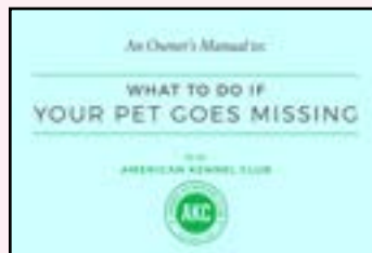
WHAT TO DO IF YOUR PET GOES MISSING