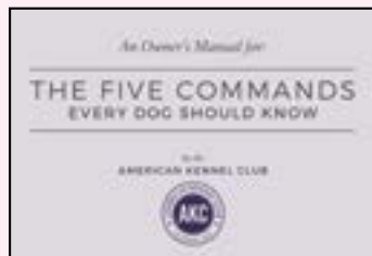
THE FIVE COMMANDS EVERY DOG SHOULD KNOW

We hope this information was valuable to you in helping your puppy live a long, healthy, happy life. Below, find additional books in our Owner's Manual series designed to strengthen the bond between you and your furry family member.