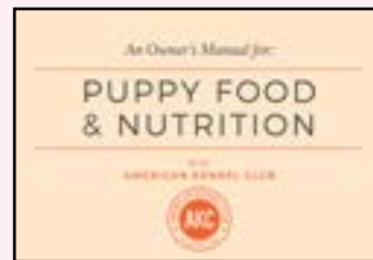
PUPPY FOOD & NUTRITION