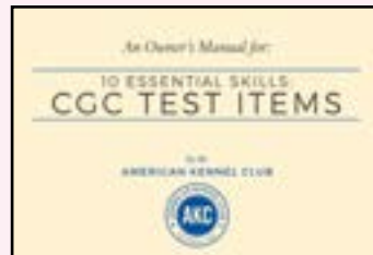
10 ESSENTIAL SKILLS: CGC TEST ITEMS