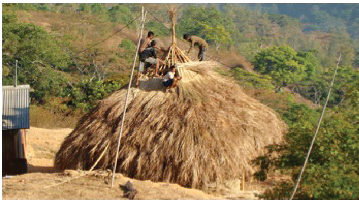
Photo: Namuleco village in Liquidoe, Aileu 35 years later