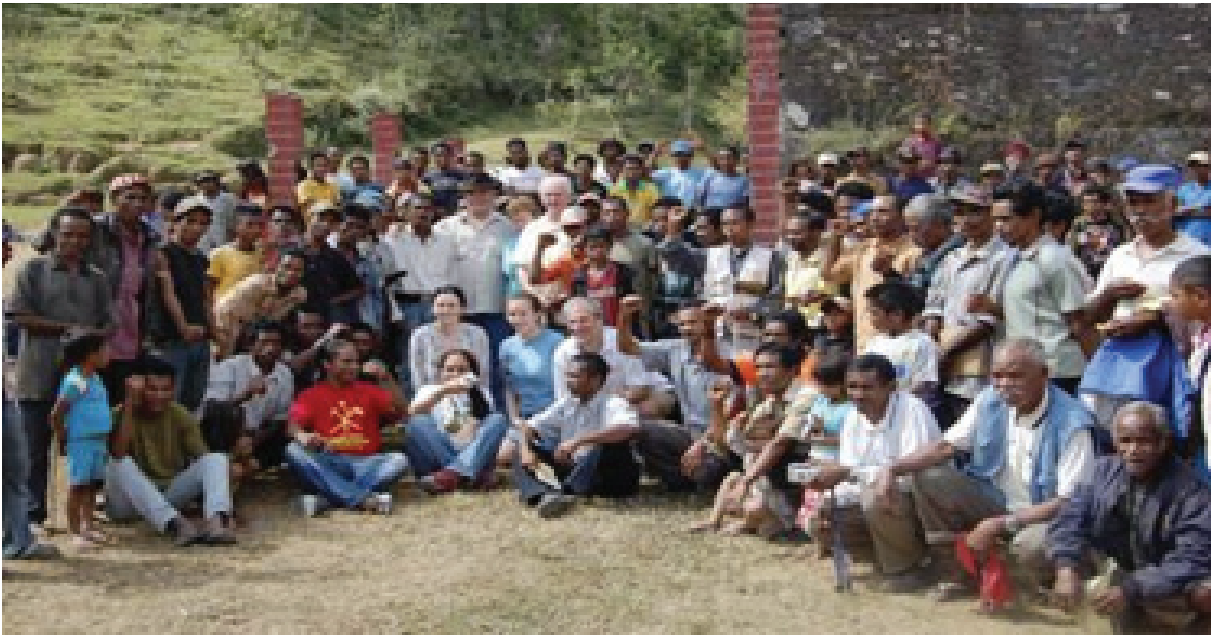
Timor Studies Association Conference delegates with farmers in Ermera July 2009