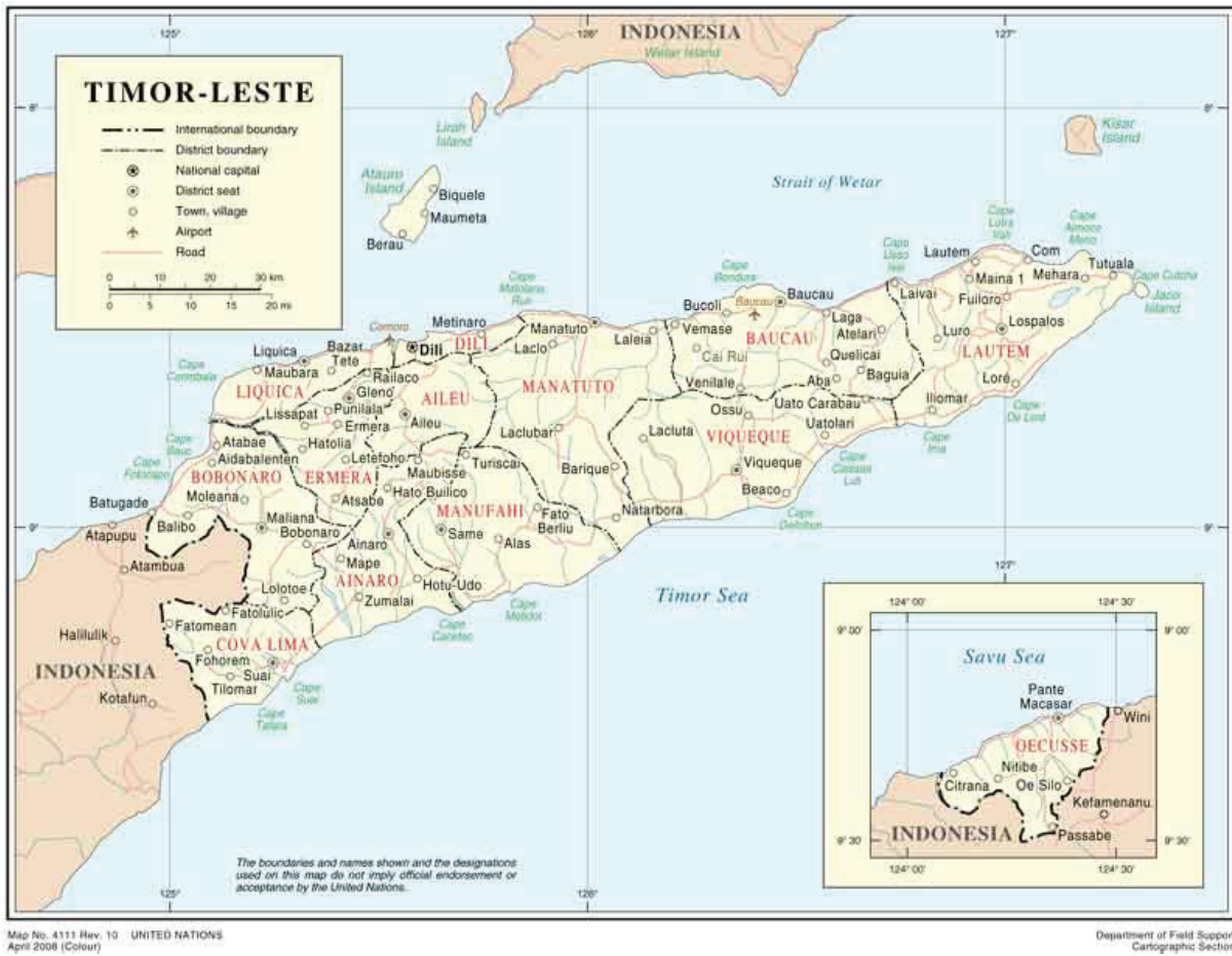
Map 1. Timor-Leste, showing the 13 districts.

Another challenge was the perception of the interviewees. There have been so many research projects carried out by both national and international researchers, that there is now a perception, which is fair and true, that researchers treat people as objects for their projects, and to make money. Consequently, researchers now do not find it easy to interview people upon arrival in a village. I used to have to spend time establishing rapport by finding common stories and sharing personal feelings of being a FRETILIN member, before an interview could be done. Sometimes, this involved sharing some cigarettes and drinks.