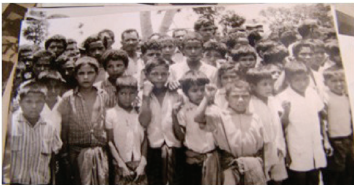
Photo. FRETILIN youth singing Foho Ramelau in Baucau 1975