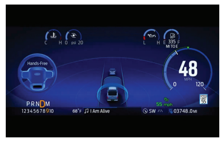
BlueCruise clearly conveys when hands-free driving is permissible, as shown here in a Ford F-150.

It's equal parts eerie and amazing to experience Ford's BlueCruise hands-free driving feature as it takes over your car's steering, braking, and acceleration while you travel down the highway.