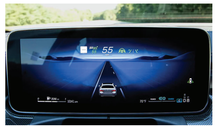
With the active driving assistance system engaged in the 2022 Mercedes-Benz C-Class, the driver's instrument panel shows the car within the lane lines, while the green steering wheel with hands icon indicates that lane centering assistance is functioning.

But Hyundai's latest Highway Driving Assist 2 is even worse. In our testing, the system consistently allowed our drivers to keep their hands fully off the steering wheel for 2 minutes and 15 seconds before the first audible warning was given to put their hands back on the wheel. "That's simply irresponsible on the part of the automaker," Funkhouser says.