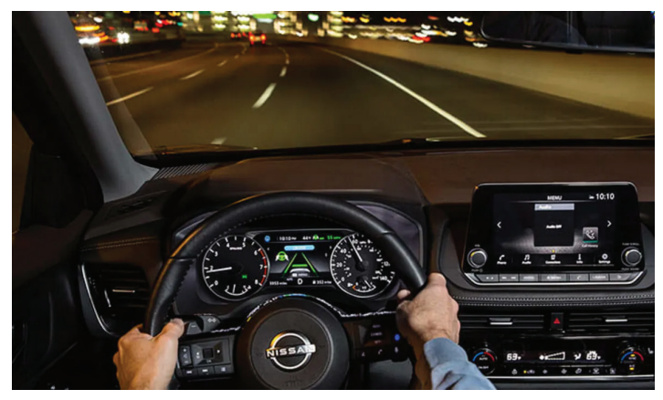
We evaluated ProPILOT Assist on the Nissan Rogue. The new Nissan Ariya will feature a direct driver monitoring system, but it wasn't available when we conducted our tests.

Our testers saw significant improvements with Hyundai's Highway Driving Assist 2, which scored 12 points higher than the original system. This is mainly because the updated version's LCA system does a much better job of keeping the vehicle near the center of the lane, rather than allowing it to ping-pong back and forth between the lane lines. While the original system still scores last of the 17 systems we've tested, Highway Driving Assist 2 ranks 11th.