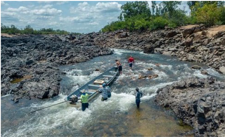
Fig. 2. Reduced water flow in the Volta Grande of the Xingu River, a 130-km stretch between the two dams that comprise the Belo Monte Hydropower Plant, decimates aquatic and seasonally flooded ecosystems, deprives traditional populations of fish and impedes transportation. Photograph: Fábio Erdos/ The Guardian (Watts, 2019).

In addition, protocols for impact assessment studies have not yet been developed for the severe changes to complex and interconnected Amazonian rivers and associated flooding cycles, which impact specific habitats and species and can affect extensive seasonally flooded areas downstream of dams (e.g., Gerlak et al., 2020; Latrubesse et al., 2017; RTAC/USAID, 2020; Schöngart et al., 2021). The protocols employed by staff hired by Norte Energia systematically fail to find any significant impacts, despite the disruption being obvious to local people and to independent researchers (Pezzuti et al., 2018; Zuanon et al., 2019). The environmental impact assessment for Belo Monte (Brazil, ELETROBRÁS, 2009) severely underestimated virtually all impacts of the project (Magalhães and Hernandez, 2009; Ritter et al., 2017). In addition to environmental impacts, multiple violations of human rights were committed in implementing the dam project (e.g., AIDA, 2018). Brazil's press coverage of Belo Monte and other dams has been found to downplay or ignore social and environmental impacts and to emphasize the narratives of the hydroelectric industry asserting that these dams are needed for economic progress (Mourão et al., 2022).