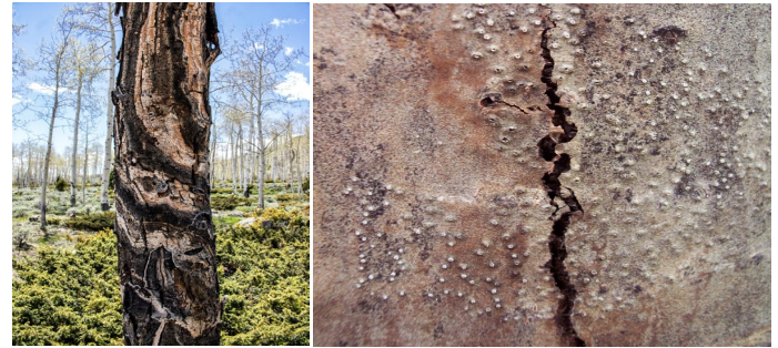
Fig. 2 Concentric rings of sooty bark canker (L); Cytospora canker fruiting bodies (R).

In mature cohorts, sooty bark canker ( Encoelia