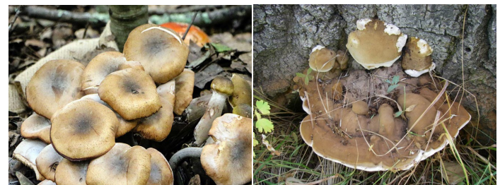
Fig. 3 Fruiting bodies: Armillaria spp (L); Ganoderma applanatum (R)

pruinosa ) was one of the most common and virulent canker diseases found in surveys in both the Intermountain and Rocky Mountain states (Colorado, Idaho, Utah, Wyoming; Guyon and Hoffman 2011, Dudley et al. 2015). This tree disease has no known relationship with environmental stress but needs wounds, typically caused by browsing animals and insects (but human cutting/carving, too!), to become established. In addition, two root diseases are common in aspen stands. Ganoderma root disease ( Ganoderma applanatum ) is largely associated with wind thrown trees in older stands. Armillaria root disease ( Armillaria spp ) is found in pure aspen stands, but is more often associated with aspen stands containing conifers. Neither root disease appears to impact aspen stands after