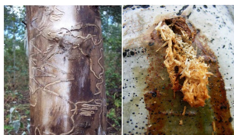
Fig. 4 Wood borers: bronze poplar borer galleries (L); Poplar borer frass (R)

Aspen are commonly affected by a diverse array of pathogens and invertebrates. Forest insects and diseases can drain an aspen clone's carbohydrate reserves, reducing its ability to resist damage or perform other vital functions like growth and regeneration. The first key to managing insects and diseases in aspen forests is recognition of when levels of insect and disease induced dieback diverge from normal background levels. The second key is to avoid regeneration treatments until the impacted aspen forests have recovered.