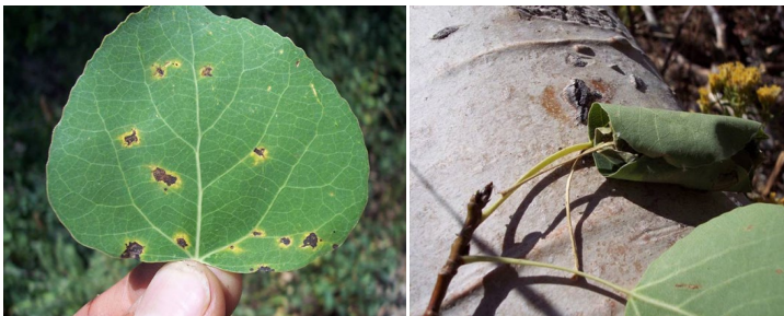
Fig. 1 Defoliators: Marssonina leaf blight (L); leaves rolled by, large aspen tortrix (R)

1) Stressors: In addition to stress caused by drought or ungulate herbivory, outbreaks of defoliation by both insect and disease agents also stress aspen stands. Two of the more common defoliating agents are Marssonina leaf blight ( Marssonina brunnae ) and the large aspen tortrix ( Choristoneura conflictana ). However, multiple consecutive years of repeated defoliation in the same location is usually required before dieback or mortality is triggered.